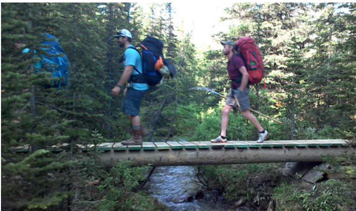
Testing the Lyaill Creek bridge