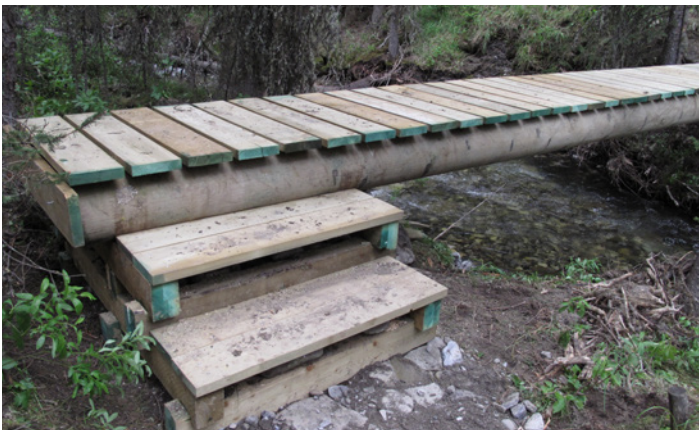
A replacement for the washed out bridge