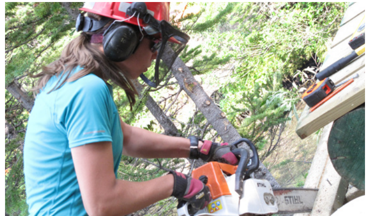
A BTFR trail crew member putting on the finishing touches to the Lyaill Creek bridge