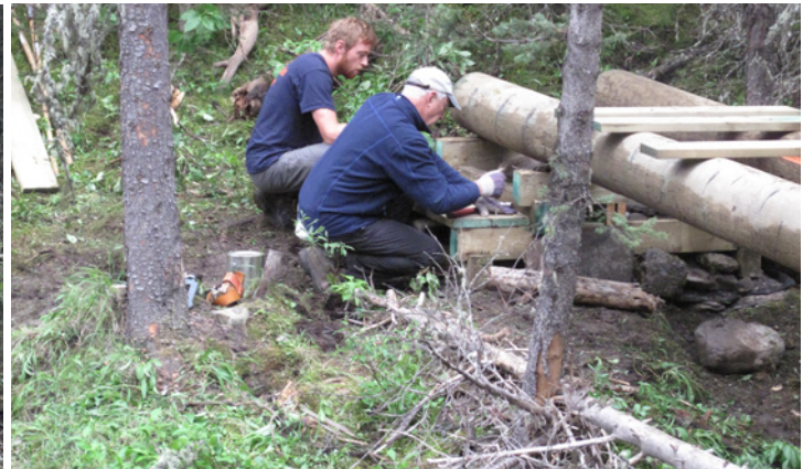
Two volunteers working on a crib to support one end of the bridge