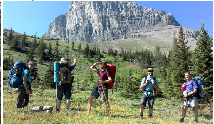
Volunteers and trail crew enjoying the scenery on the Great Divide Trail