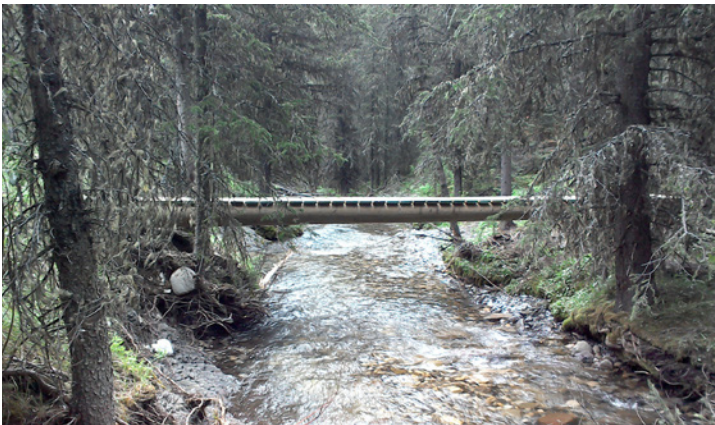
Bridge over Cache Creek