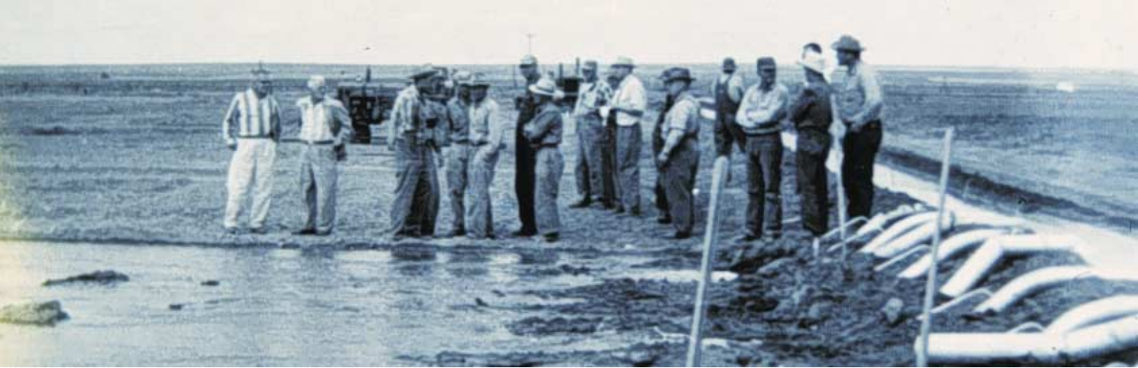
Farmers at a demonstration of surface irrigation using syphon tubes.