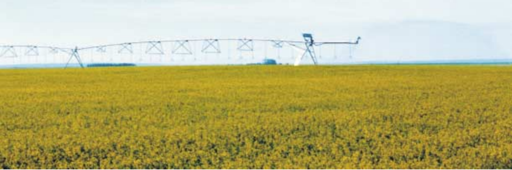
A modern pivot irrigation system irrigates a field of canola.