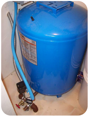
Figure 2: Pressure tank

If the aquifer cannot supply enough water on demand, a reserve potable water storage tank and a second pump must be added to your water system to ensure no damage to the well or aquifer is incurred (Figure 3).