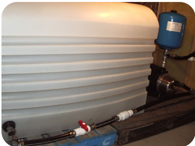
Figure 3: Tank and pump for low producing well

To avoid over-pumping, the pump must be sized correctly and the flow controlled so that it never draws water from the well at a rate higher than the aquifer is capable of providing. The water from the well is then