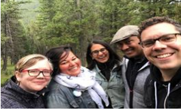
Innovation – Edmonton SHIFT Lab