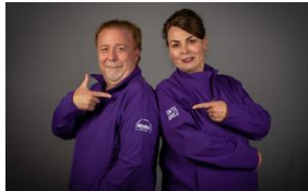
Partnerships & Collaboration – East Calgary Ambassador Program