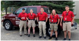
Partnerships & Collaboration – The Watch Project