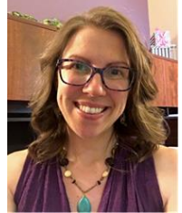
Partnerships & Collaboration – China Sieger, Peace Regional Restorative Justice