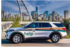
Innovation – Edmonton Police HELP Unit