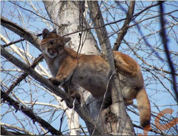
In this photo of a female cougar, the black spot is hidden by the base of the tail.

From December 1 to the last day of February, the season for either male or female cougars may be closed in a Wildlife Management Unit while the season for the other sex remains open. In these cases, hunters must be able to identify the sex of a cougar prior to harvest. Adult male cougars have a conspicuous black spot approximately four-to-five inches (10-to-14 cm) below the anus. Female cougars have a much smaller, conspicuous black spot approximately one inch (two-to-three cm) below the anus. The black spot on female cougars is often hidden by the base of the tail. Hunters are encouraged to use binoculars to look for the location of the black spot. It may be necessary to make the cougar shift position in order to get a good look. Banging a branch against the tree will often make the cougar move.