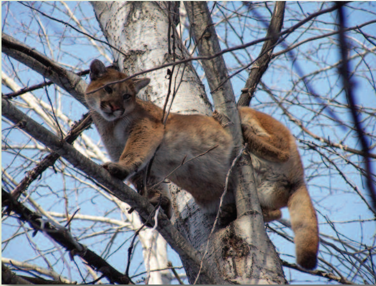
In this photo of a female cougar, the black spot is hidden by the base of the tail.

From December 1 to the last day of February, the season for either male or female cougars may be closed in a Wildlife Management Unit while the season for the other sex remains open. In these cases, hunters must be able to identify the sex of a cougar prior to harvest. Adult male cougars have a conspicuous black spot approximately four-to-five inches (10-to-14 cm) below the anus. Female cougars have a much smaller, conspicuous black spot approximately one inch (two-to-three cm)