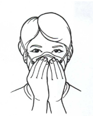
Figure 3 Positive pressure user seal check – Disposable filtering facepiece respirator

For disposable respirators, the user seal checks are done somewhat differently. For non-valved disposable respirators, both hands must be placed completely over the respirator while the wearer exhales. The respirator should bulge slightly. For disposable respirators that have a valve, both hands should be placed over the respirator and the user inhales sharply. The respirator should collapse slightly. If air leaks at the edges of the respirator, it should be re-positioned and adjusted for a more secure fit and the test repeated. If the seal check cannot be successfully completed, another type/style/size of respirator should be tried.