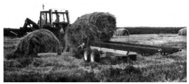
FIGURE 2. Approaching Bales.

Loading: Ease of loading was very good. The Laurier 2125 was placed in field position by removing the lift arm safety lock and lowering the lift arm to the ground. Bales were approached with their longitudinal axis parallel to the direction of travel (FIGURE 2). Just before the first bale was picked up, the bale forks were adjusted to ensure their proper width for the size of bales being handled. The lift forks adjustment was accomplished by loosening the bolts that hold the forks in place on the lift arm, and sliding the forks to the desired position. Once the forks were located in the desired position, they were locked in place by tightening the bolts. Adjusting the lift forks was easy and took one person about 5 minutes. The Laurier 2125 was moved ahead until the bale contacted the lift arm, the lift arm was raised and the bale rolled from the forks to the bale bed. The hydraulic motor was activated and the conveyor chains moved the bale to the rear to make room for another bale. This process was continued until the load was completed.