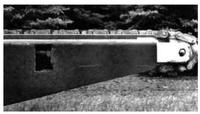
FIGURE 3. Conveyor Chain Adjustment.

Lubrication: Ease of lubrication was very good. Lubrication on the Laurier 2125 was easy and consisted of greasing the eight pressure nipples at the start of each workday. In addition, the conveyor chains were brushed with used motor oil at the start of each work day.