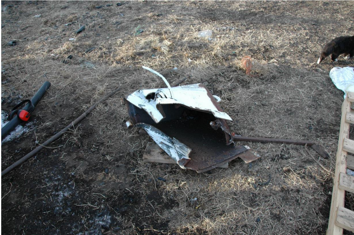
Photograph 4 – Shows the guard.