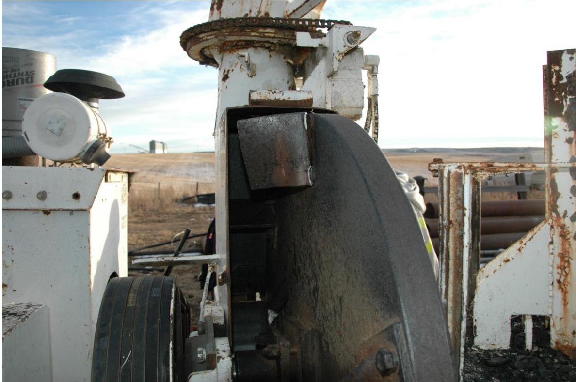
Photograph 5 – Shows the chipping wheel with a damaged paddle.