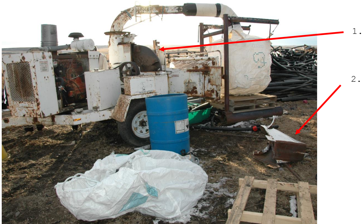
Photograph 2 – Shows the chipper and guard.