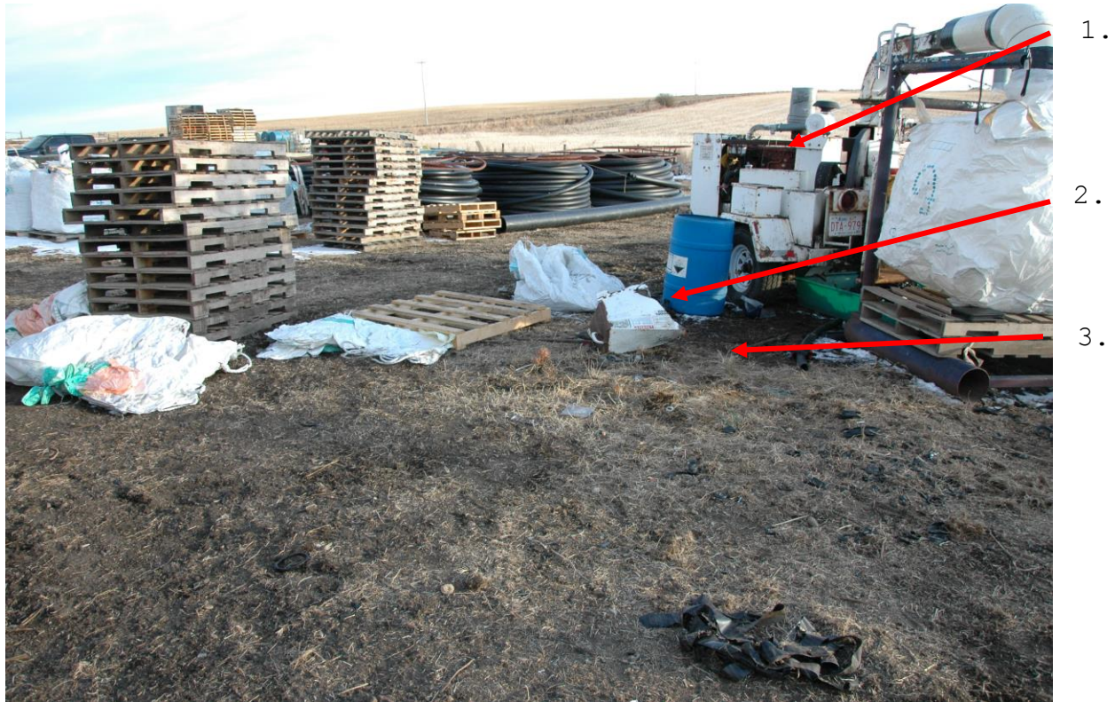
Photograph 3 – Shows the chipper and guard.