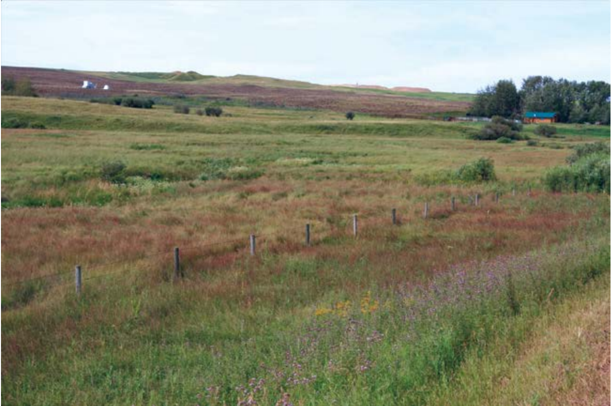
Cumulative Effects: Cultivation, Road Ditch with Invasive Species, Cabin, Wellsite and Gravel Pit on Native Grassland.

Minimum disturbance practices are an essential tool in the management of cumulative effects in native grasslands.