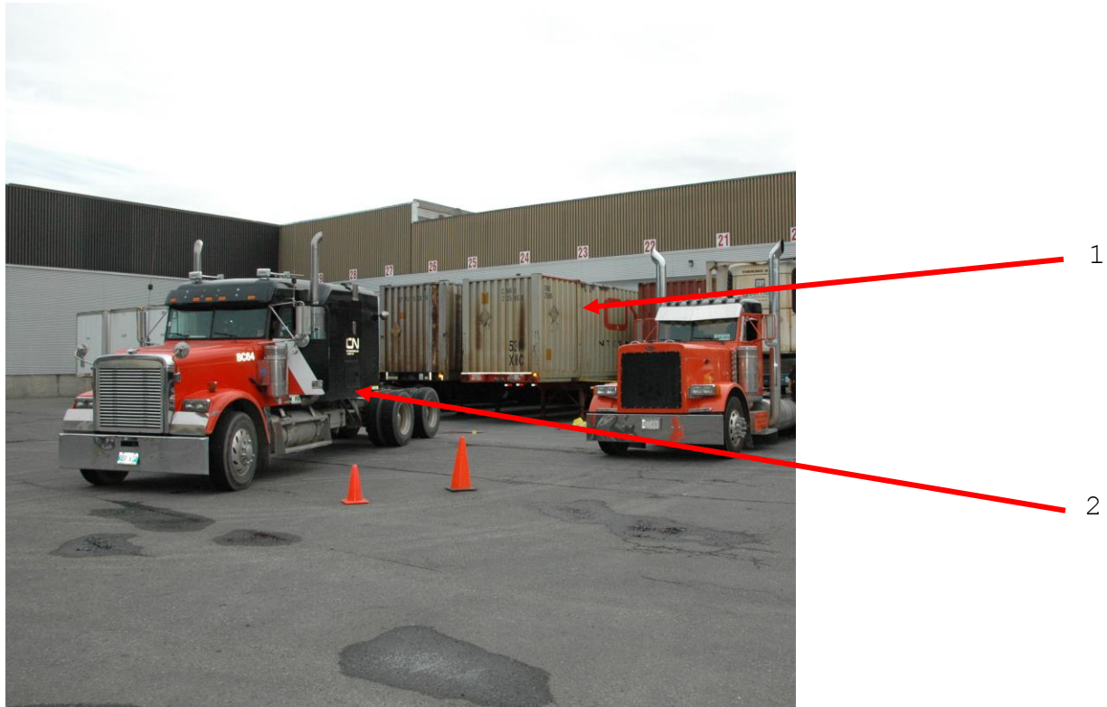
Photograph 1 – Shows the receiving dock where the incident occurred.