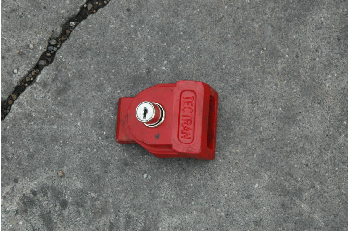
Photograph 4 – Shows the glad hand lock found near the worker.