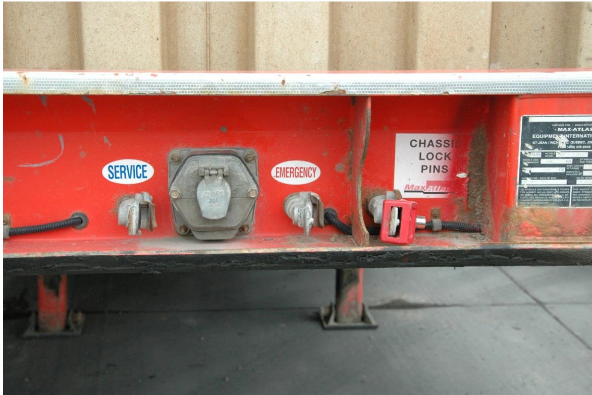
Photograph 5 – Shows the unlocked glad hand lock on the airline of the trailer involved in the incident.