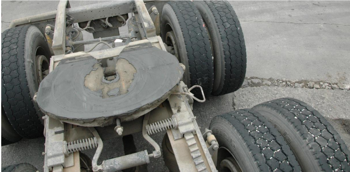
Photograph 3 – Shows the back of the tractor unit and the space between the second and third axles.