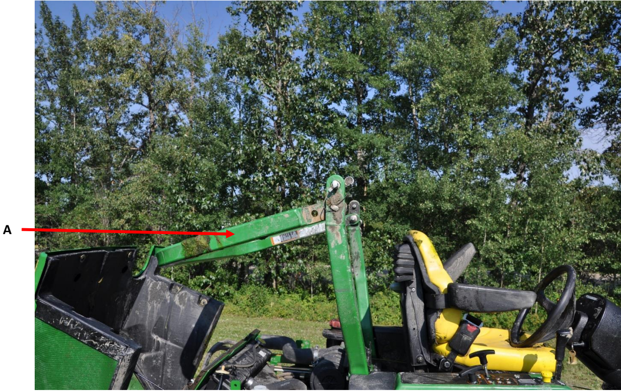
Figure 4. Right side of the riding lawnmower.

A. Closer view of the ROPS in the folded down position.