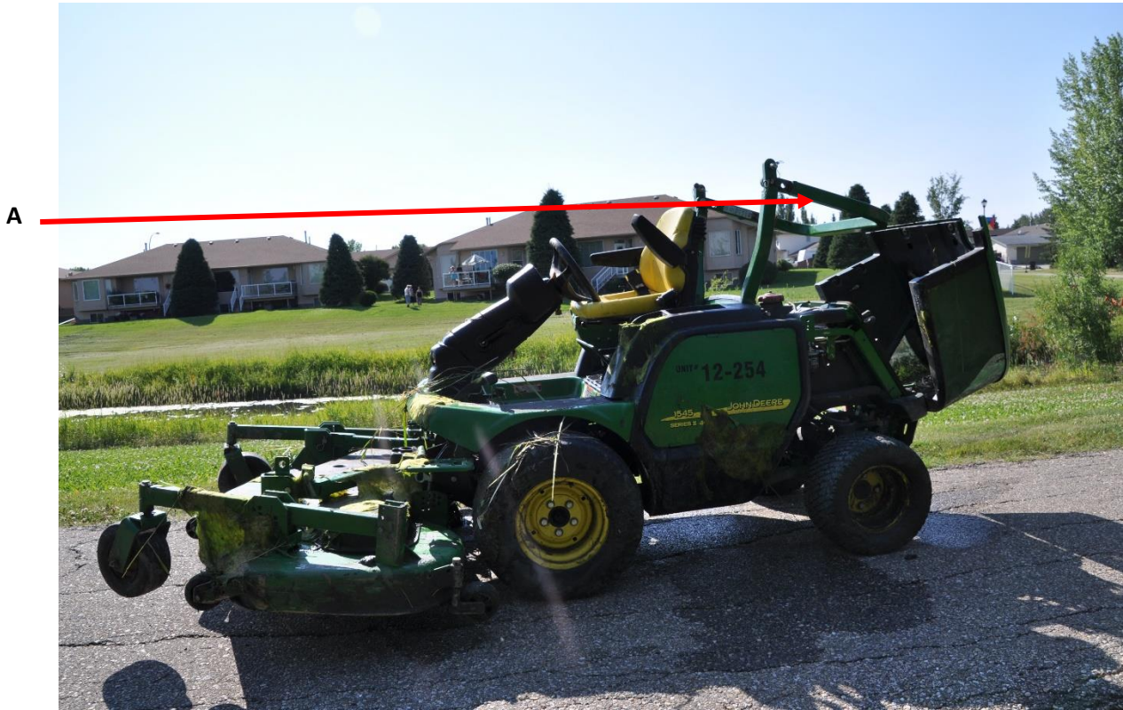
Figure 3. Left side of the riding lawnmower.