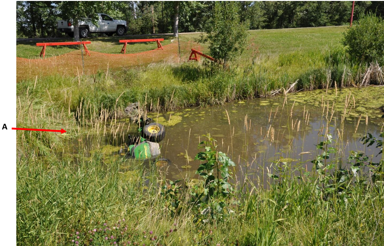
Figure 2. North end of the pond looking west.

A. Where the riding lawnmower operated by general labourer 1 slid into the pond.