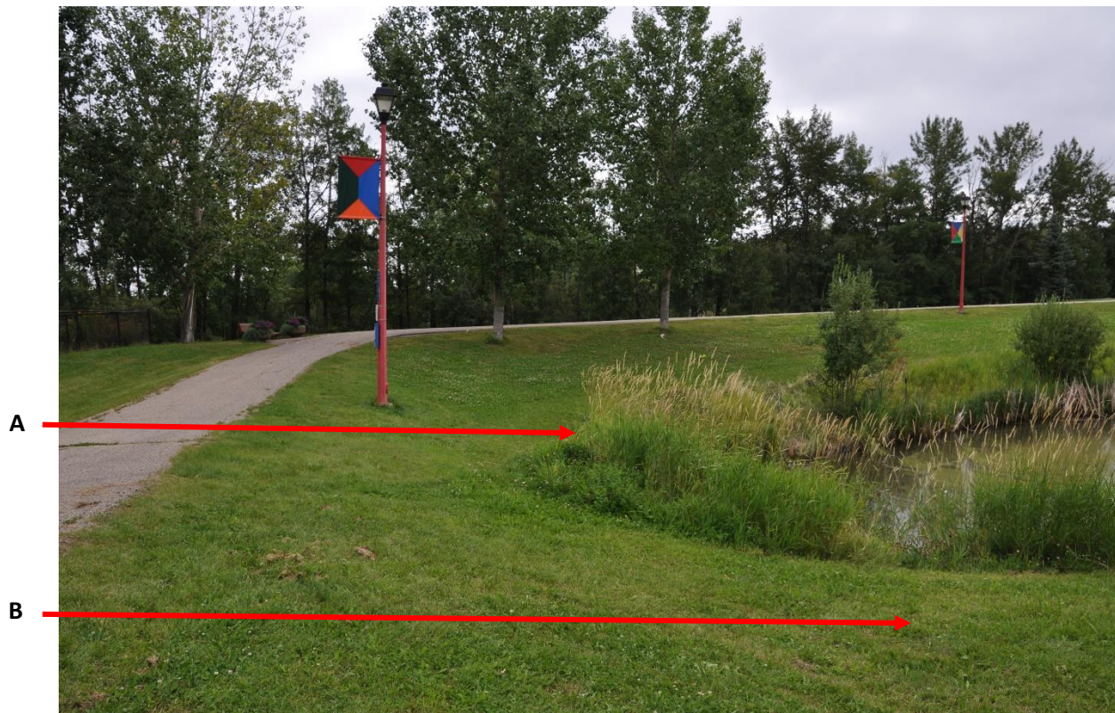
Figure 6. Investigation photograph of incident location looking west.