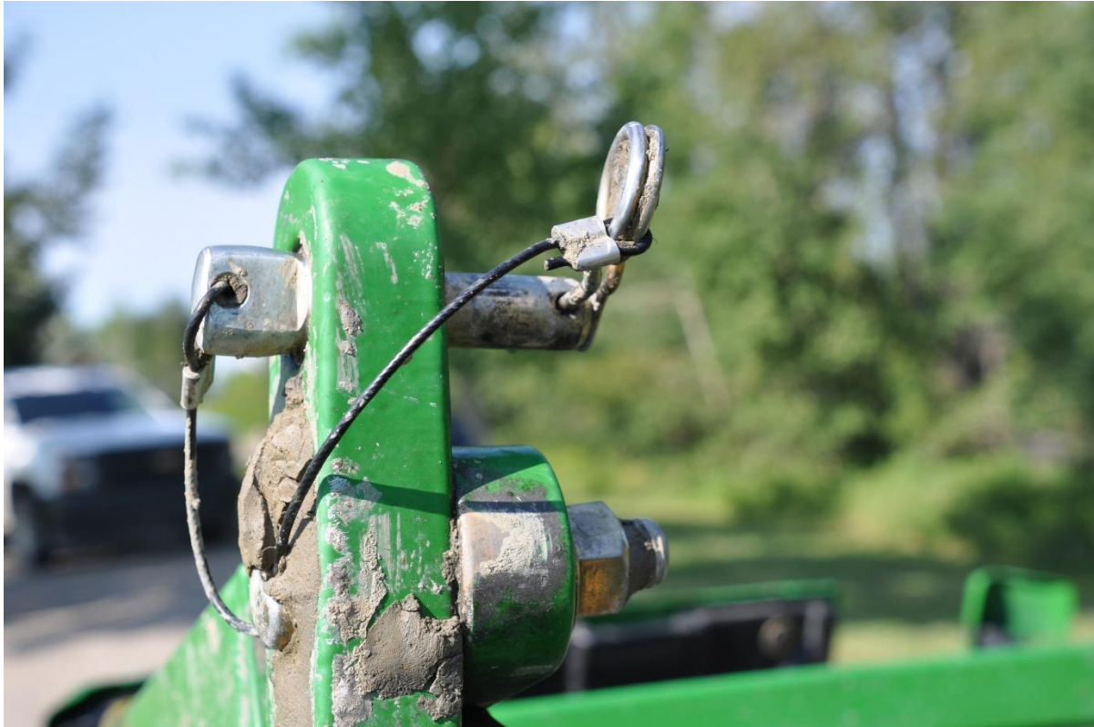
Figure 5. Close up of the locked pin holding the ROPS in the folded down position.