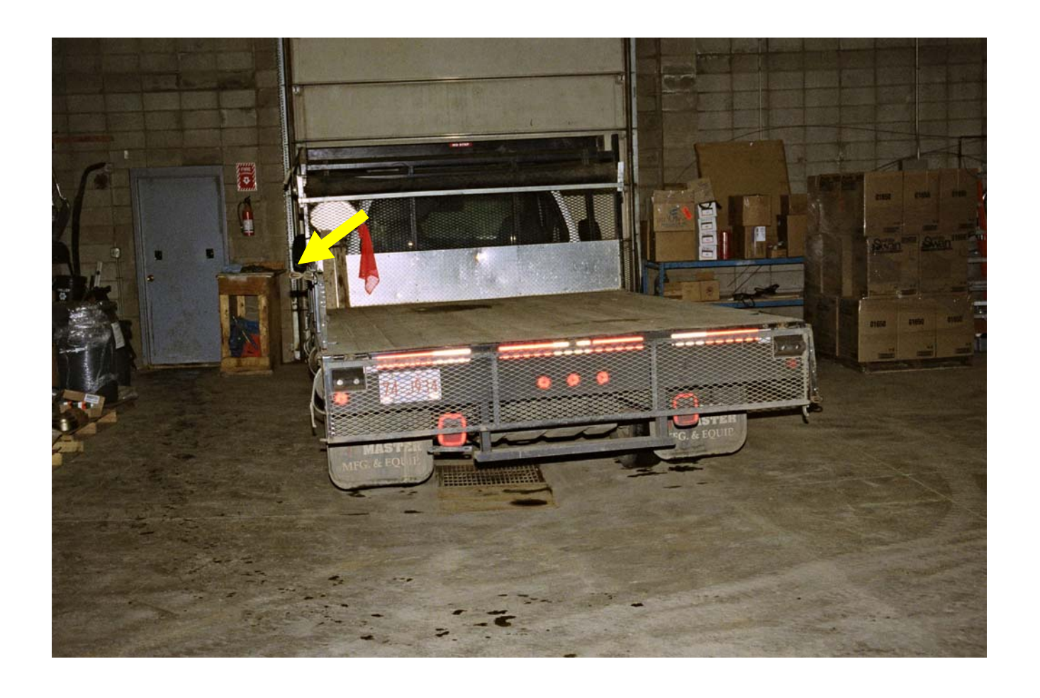
Photograph #2 Shows the flatbed fitted to the truck. Arrow shows pieces of 2x4 used to prevent load straps from deforming the load.