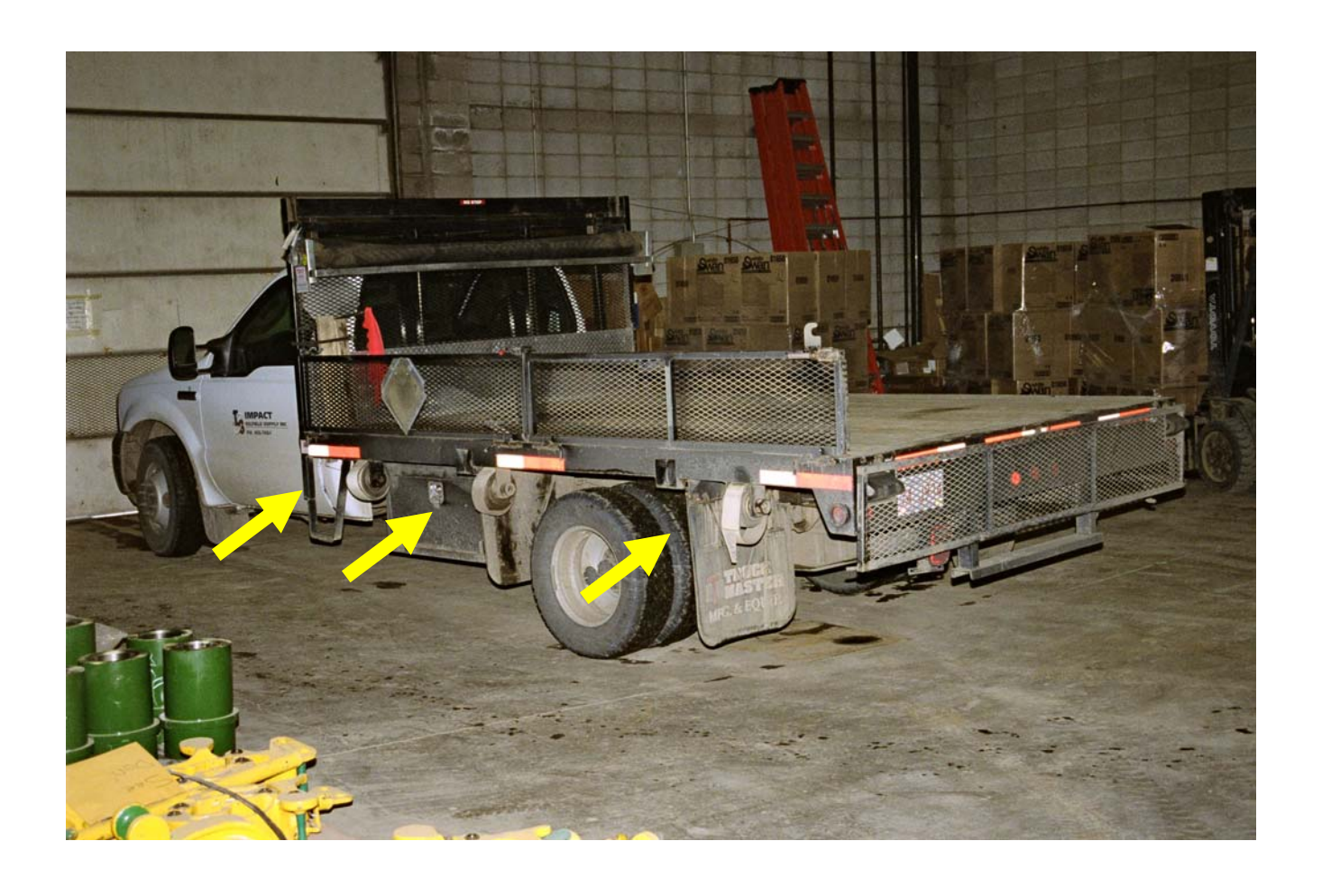
Photograph #1 Shows the flatbed truck in the Cando Oilfield Supply & Rentals Ltd. loading bay at 2104-8 Street, Nisku, Alberta. Arrows indicate the load securing strap reels fitted to the driver's side of the truck.