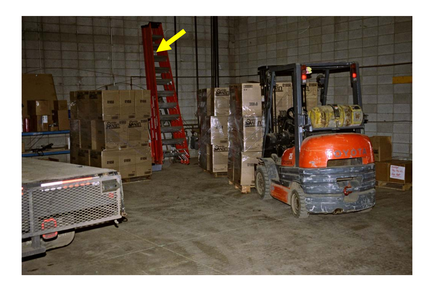
Photograph #5 Shows the fork lift and pallets of industrial paper similar to those that were being loaded onto the truck at the time of the incident. Arrow indicates stepladders stored in the shop and readily available.