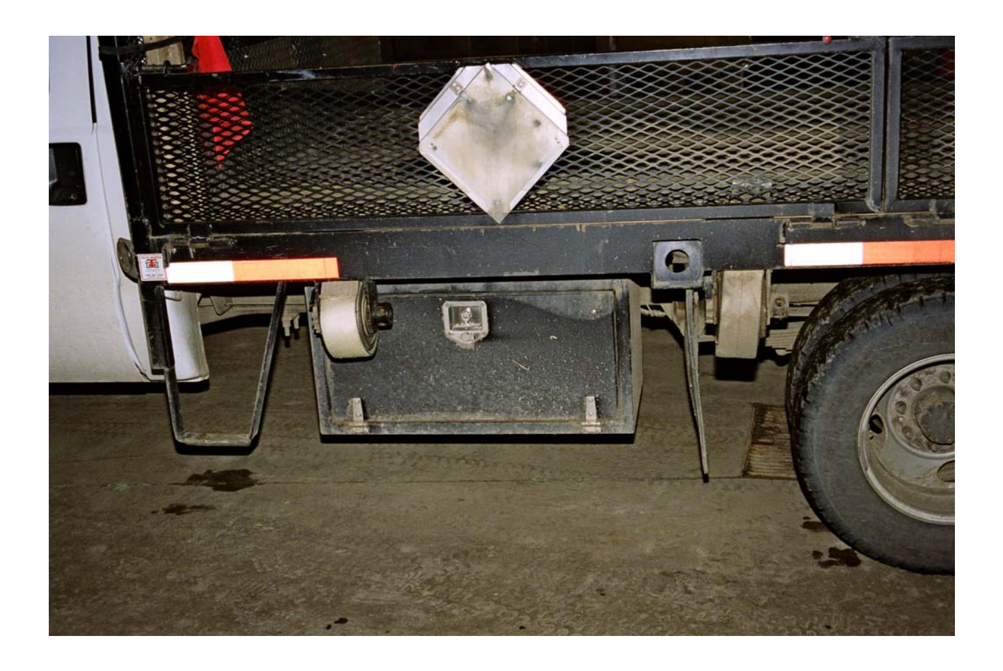
Photograph #4 Shows a close-up view of the two front load securing strap reels on the driver's side of the truck.