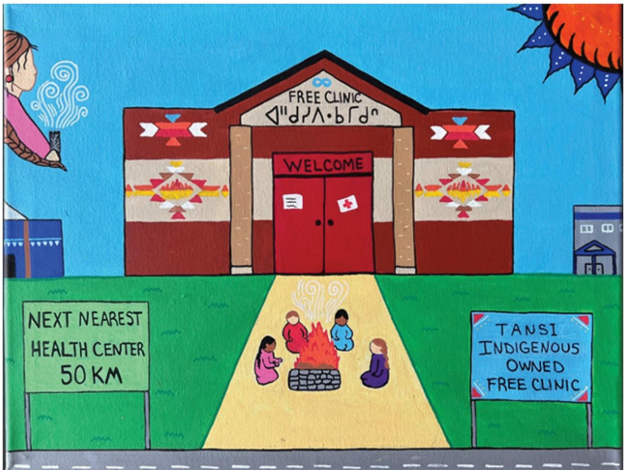
Image Credit: Indigenous Clinic of Tomorrow , Painting by Dilliah Bourque