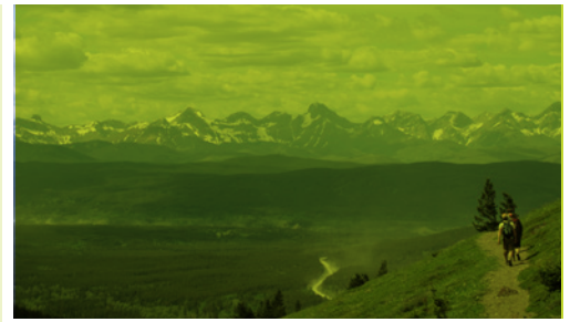
Table Mountain Trail