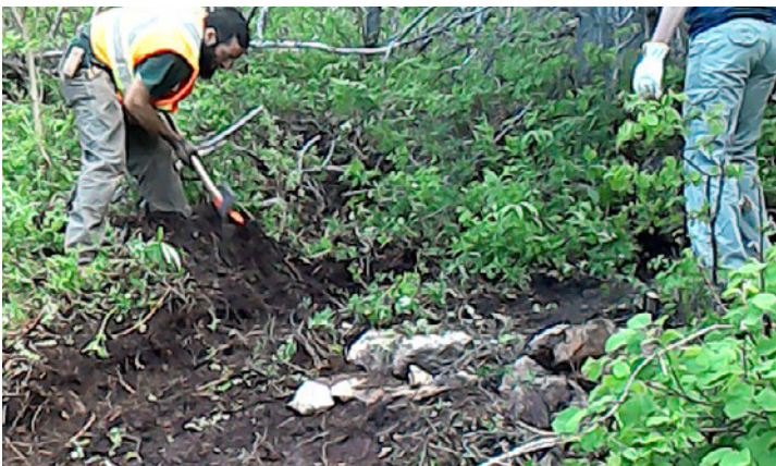
Staff and volunteers constructing steps on a reroute