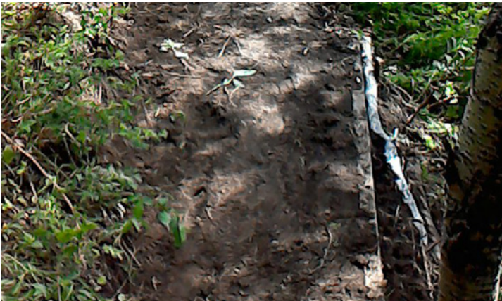
Trail stability feature of a slumped area