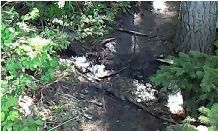
Before photo of the bridge location