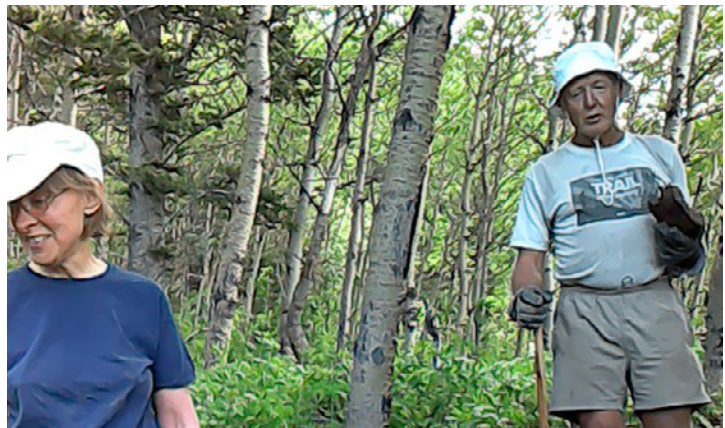
Volunteers hard at work