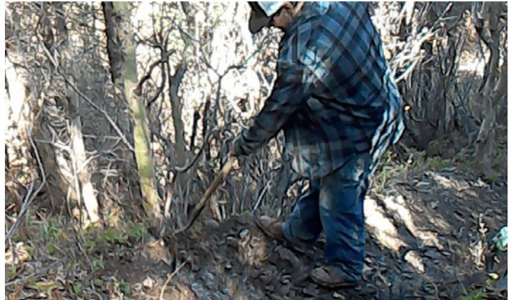
Staff completing a water drainage feature