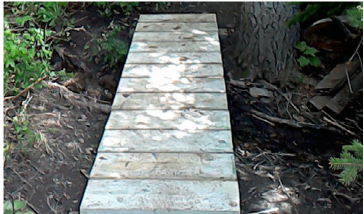
After photo of the bridge location