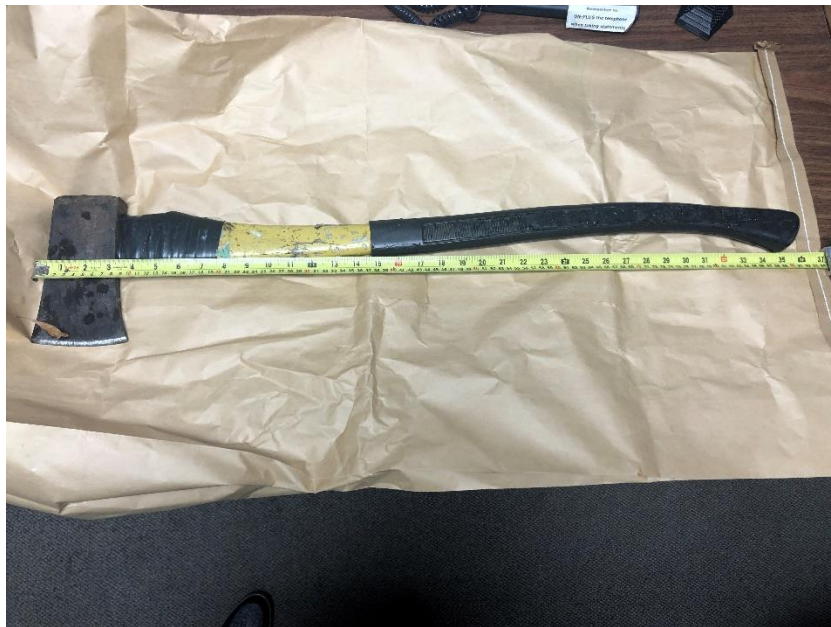
Axe recovered from the scene

Two weapons were recovered from the scene.