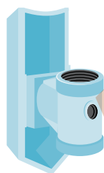
Figure 1: Pitless adaptor

Well pits were installed to provide a frost free location for the pressure system. Over time, well pits have proven to be a significant source of contamination to water wells so they are no longer permitted for newly constructed wells. If you have a well pit, have a licensed water well