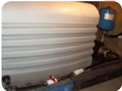
Figure 3: Tank and pump for low producing well

To avoid over-pumping, the pump must be sized correctly and the flow controlled so that it never draws water from the well at a rate higher than the aquifer is capable of providing. The water from the well is then