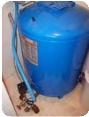
Figure 2: Pressure tank

If the aquifer cannot supply enough water on demand, a reserve potable water storage tank and a second pump must be added to your water system to ensure no damage to the well or aquifer is incurred (Figure 3).