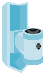
Figure 1: Pitless adaptor

Well pits were installed to provide a frost free location for the pressure system. Over time, well pits have proven to be a significant source of contamination to water wells so they are no longer permitted for newly constructed wells. If you have a well pit, have a licenced water well