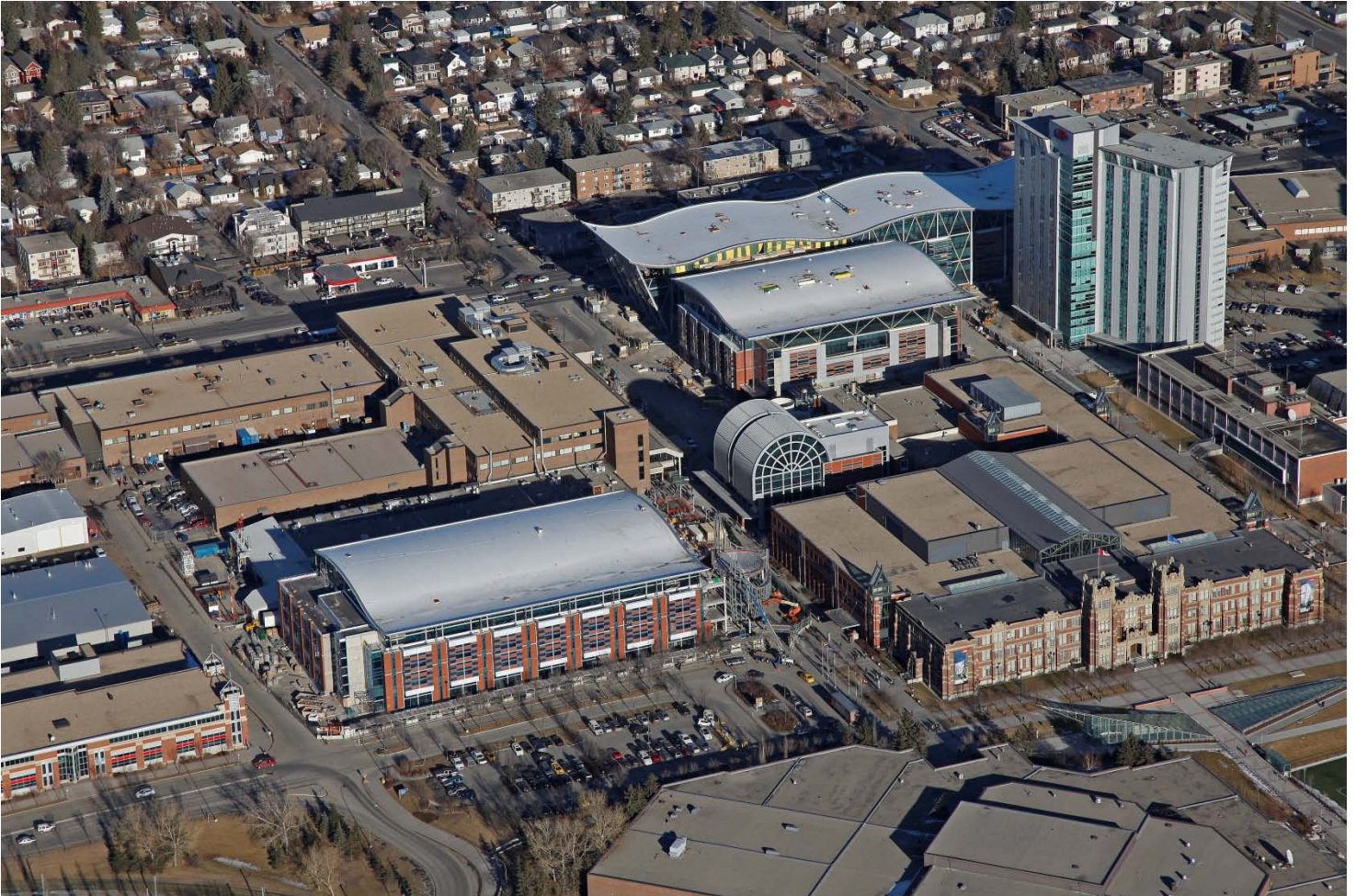
SAIT – Trades & Technology Complex