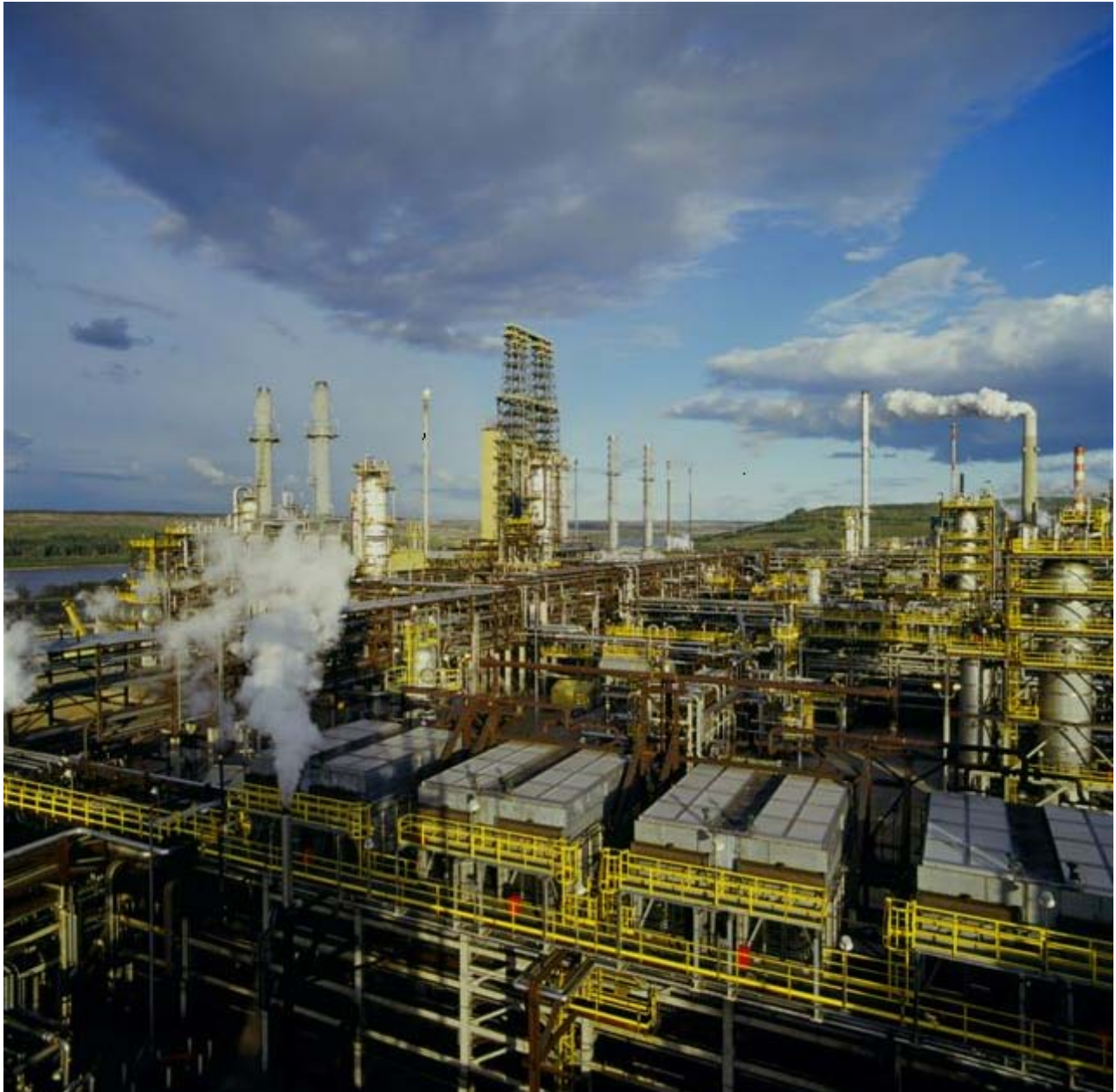
SUNCOR UPGRADE – FORT MCMURRAY