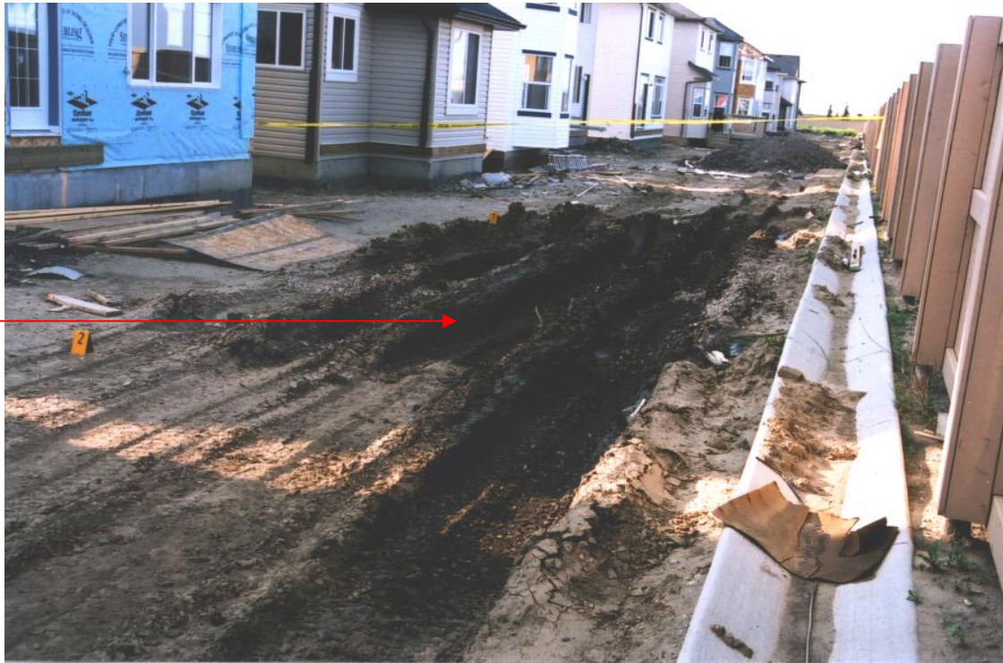
Photograph 2: Shows a close up view of the mud pool where the gravel truck was stuck.