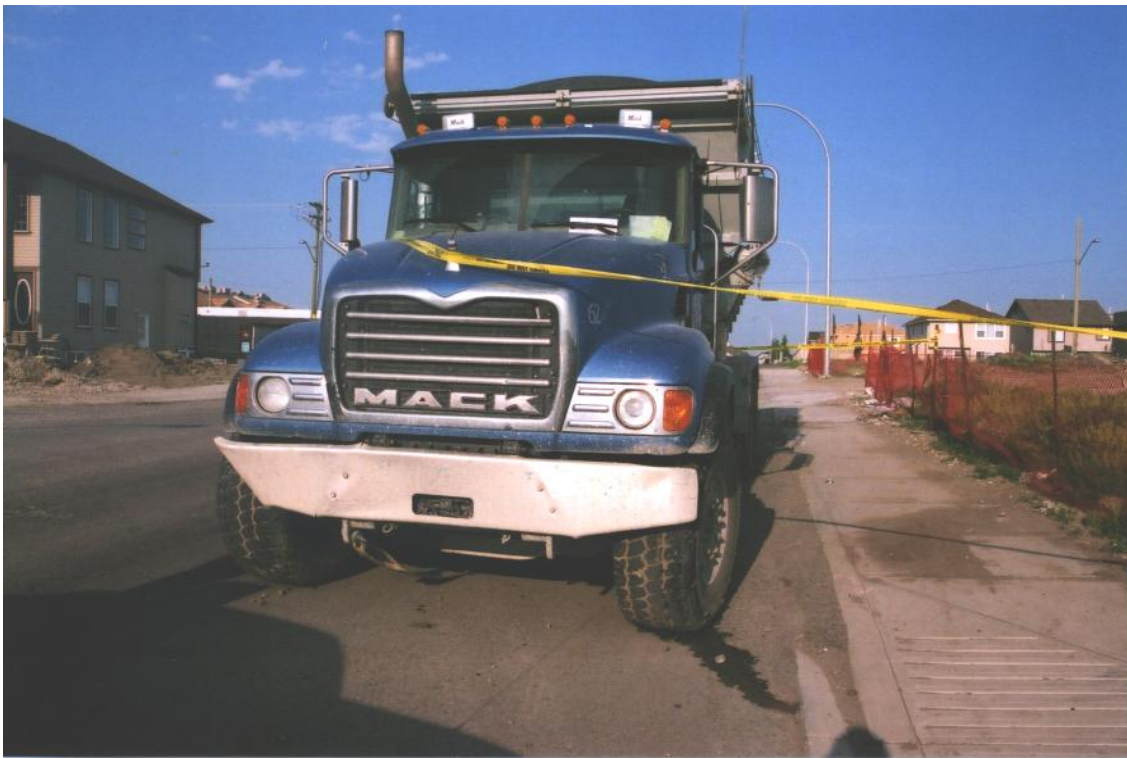
Photograph 4: Shows front view of the gravel truck involved in the incident.