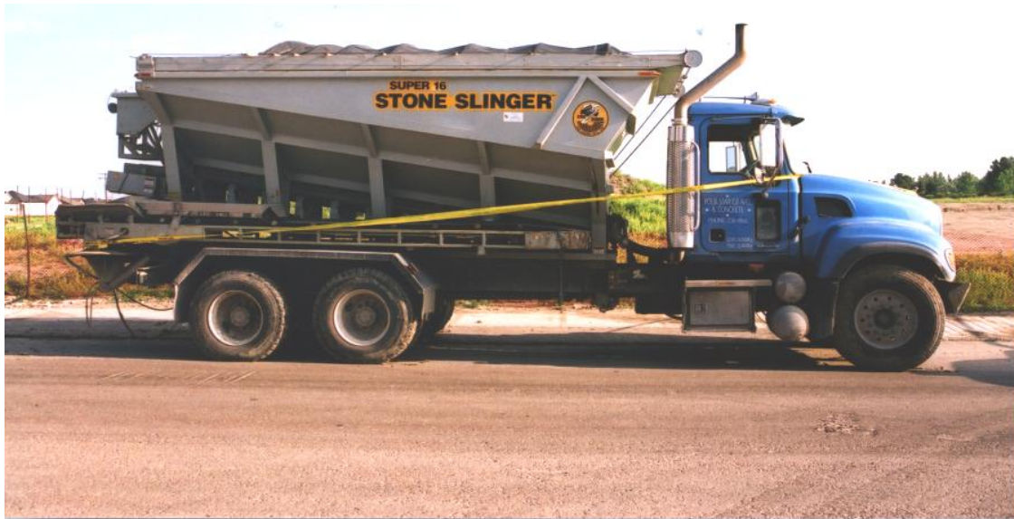
Photograph 3: Shows the gravel truck involved in the incident.