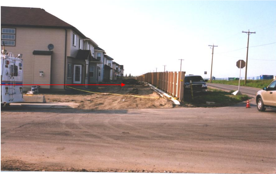
Photograph 1: Shows the location of the incident. Arrow shows the mud pool where the gravel truck was stuck.