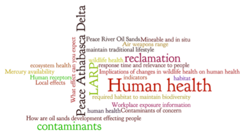
Figure 1: Key areas of interest based on participants' input during breakout sessions at the oil sands monitoring forum in June 2014

June 4-5, 2014 – The June forum marked the beginning of the 2015–2016 monitoring planning cycle. A broad cross-section of stakeholders provided input on needs, issues and questions important to their organizations and communities. Figure 1 below depicts participants' input during the June forum breakout sessions. This input was considered in the process of developing the 2015–2016 monitoring work plan.