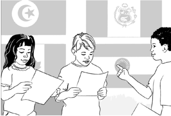
These students are presenting their work to the class

Students learn new things in different ways. They use computers, books and equipment. They learn by trying things and talking with others. Sometimes students work in groups. Sometimes the whole class works together.