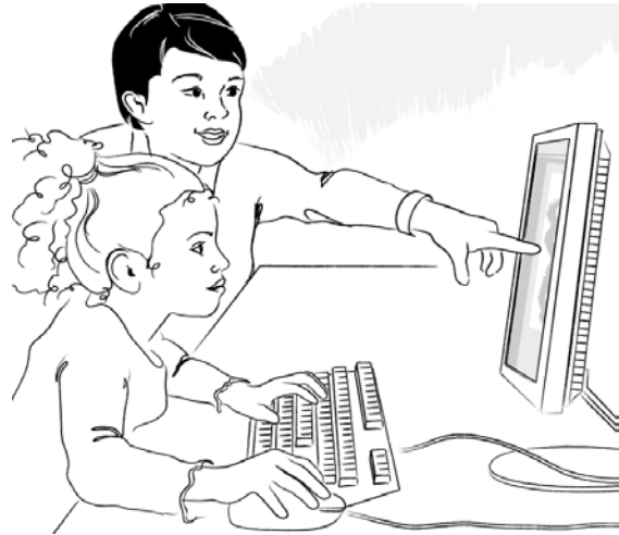
These students are using a computer to learn.

Students learn from their teachers. Students learn from each other. And they learn from you!