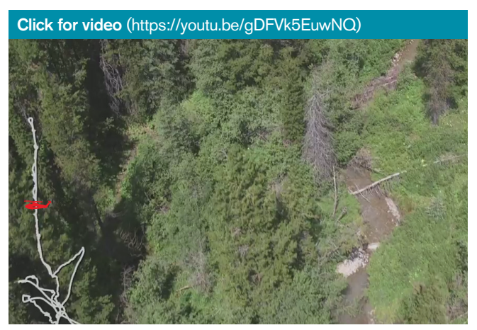
Helicopter Flight Path