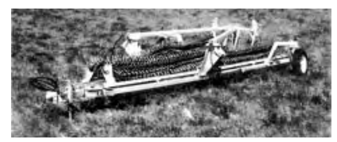
FIGURE 6. Transport Position.

The wing wheel castors had springs at the pivots to reduce wheel shimmy in transport. These springs were very loosely adjusted at the start of the test resulting in severe wheel shimmy on rough roads. Tightening the springs eliminated the wheel shimmy and improved transporting.