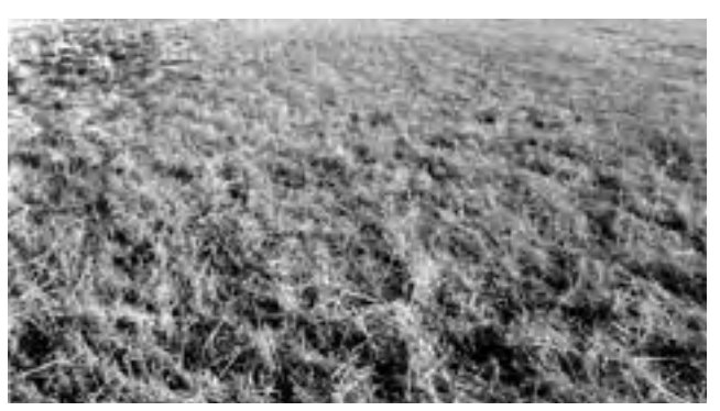
FIGURE 4. Hail Damaged Wheat (Second Pass).

Trash Retention: Trash retention of the harrow was very good.