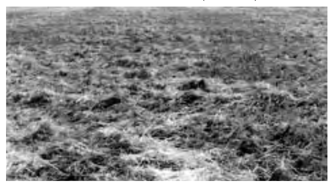
FIGURE 3. Straw Spread (After Two Passes).

In wheat stubble, when set at the 45° harrow angle, chopped straw left by the combine was moved about 3 ft (0.9 m) when operated perpendicular to the direction of the previous combine operation. Harrowing the field a second time in the same direction moved the straw approximately another 4 ft (1.2 m) (FIGURE 3). In extremely heavy trash conditions, the trash was left evenly on the field surface after one pass. However, a second pass resulted in small straw bunches on the field surface (FIGURE 4).