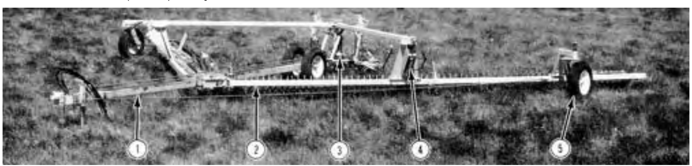
FIGURE 1. Phoenix Rotary Harrow Model HT140: 1) Hitch Frame. 2) Wing Frame, 3) Transport Motor Drive Location, 4) Tine Lift Cylinders, 5) Wing Wheels.

Phone: (403) 425-2633 FAX: (403) 421-8400