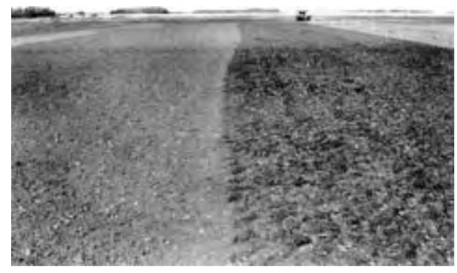
FIGURE 2. Field Surface in Summerfallow.

The soil finish in fallow conditions was usually very level. The rear centre harrow, when properly adjusted, was effective in levelling the ridge left between the main harrow sections. In dry and moist soil conditions while using harrow angles of 35° or more, the surface was fine, with most trash lying loosely on the soil surface (FIGURE 2).