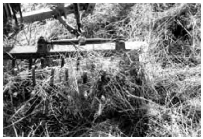
FIGURE 5. Tough Material Wrapped at Bearings.

Green weeds and tough straw wrapped tightly at the three trailing tine bearing locations (FIGURE 5). The wrapped material required frequent removal in weedy or tough straw conditions. It is recommended that the manufacturer consider modifications to the tine bearing mounts to prevent wrapping of tough material.