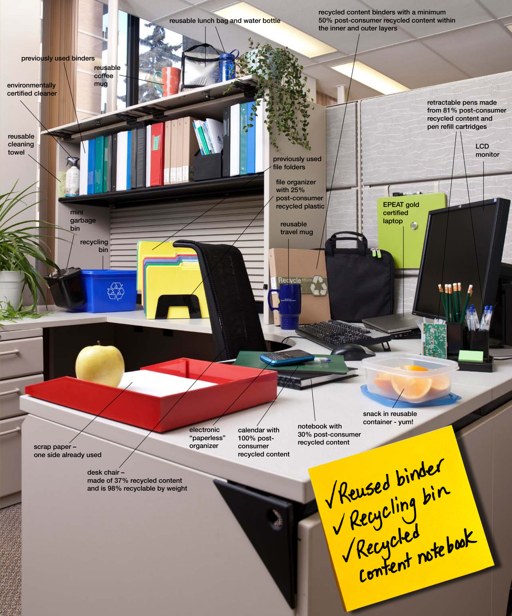
reusable lunch bag and water bottle