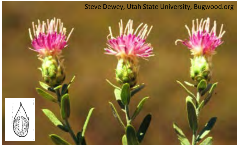
Steve Dewey, Utah State University, Bugwood.org

( Centaurea spp.) Other knapweeds are going to be similar to Russian knapweed. The key feature for differentiating all knapweeds from one another is to compare the unique bracts. The link under "Resources" is an excellent resource to walk you through identifying knapweeds. May be mistaken for a thistle at a passing glance but upon inspection, all parts of Russian knapweed lack spines.