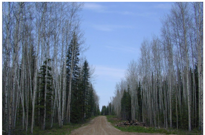
Figure 4. Defoliation caused by forest tent caterpillar larvae

It is unlikely that the current forest tent caterpillar outbreak will significantly decline in 2015. The future of the aspen twoleaf tier outbreak is more difficult to predict due to a lack of experience with this pest in Alberta. Based on reports from other prairie provinces, the twoleaf tier does occasionally outbreak, but the outbreaks have been short-lived.