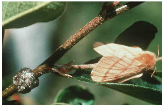
Figure 1. Forest tent caterpillar moth and eggmass

Also, they can become a traffic hazard by creating slippery road conditions when thousands of caterpillars (Figure 2) crossing highways are run over by vehicles.