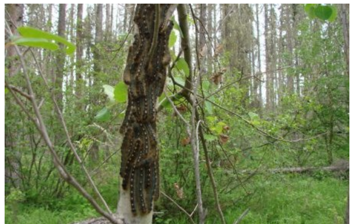
Figure 2. Forest tent caterpillar larvae on tree stem

The Alberta government routinely uses aerial surveys to monitor defoliator population levels. When outbreaks are identified, ground surveys are used to determine the exact pest responsible.