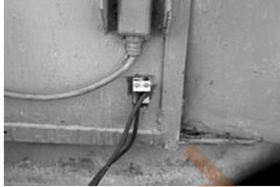
Note - double metal-to-metal connection