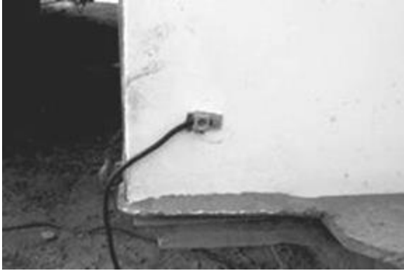
Note - single metal-to-metal connection