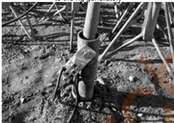
a) The rig guyline anchor (usually the closest one to the rig generator)