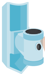
Figure 1: Pitless adaptor

Well pits were installed to provide a frost free location for the pressure system. Over time, well pits have proven to be a significant source of contamination to water wells so they are no longer permitted for newly constructed wells. If you have a well pit, have a licensed water well