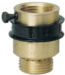
Figure 1: Atmospheric vacuum breaker

The simplest device is an atmospheric vacuum breaker that attaches to the hose bibb of an outside faucet or yard hydrant. It has a check valve to stop back siphonage and an air vent that is normally closed when the water system is in use. To avoid freezing when not in use, the air vent is opened to allow draining of the fixture and hose while still preventing back siphonage of contaminated water.