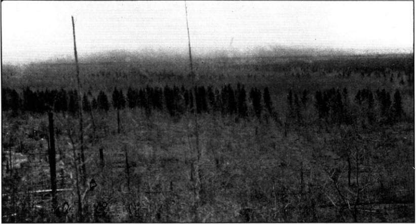
Fig. 1—Restocking on an area which has been severely burned. Note young poplar with strips of pine. Photograph represents good topography of W2 area on south slope of Blueberry plateau.