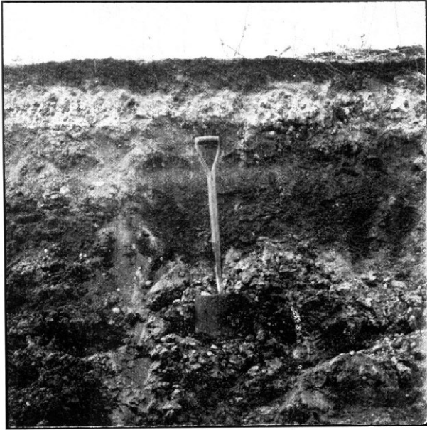
Fig. 1—Soil profile of second class wooded area (W2). Note badly leached light colored horizon near surface.