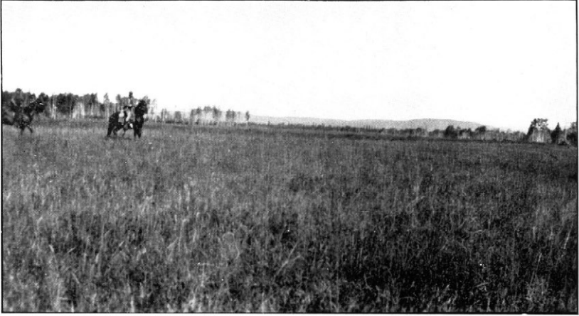
Fig. 1—Fertile parkland soils (A2) on Eureka prairies, north side of Peace river. Note open area with light clearing and good topography.