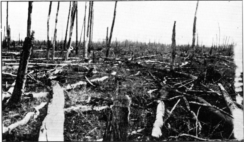
Fig. 2—Severe burn on wooded soil. Note the fallen dry timber. Another fire would destroy most of the timber and make the area suitable for breaking, with a minimum cost for clearing.