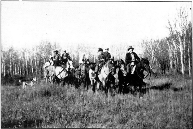
Fig. 2—Fertile parkland soils on Eureka prairie. Note medium clearing. These soils have from 120 to 140 acres of arable land per quarter section.