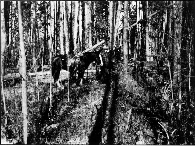
Fig. 1—Heavy clearing on wooded soil. This type of growth characterizes the W3 and W2 areas, except where the trees have been destroyed by fire.