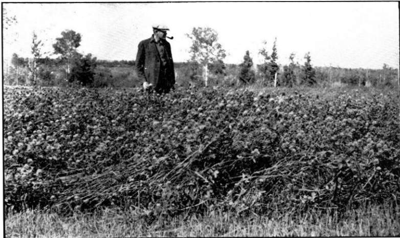
Fig. 2—A heavy stand of red clover on second class wooded soil. The soil was well prepared and heavily manured before seeding the clover. This crop would furnish excellent feed and improve the wooded soils if proper efforts were taken to insure its growth. Clover should be especially included in any program dealing with the management of the wooded soils.