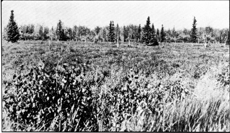
Fig. 1—Open muskegs are numerous in certain parts of the wooded soil areas.