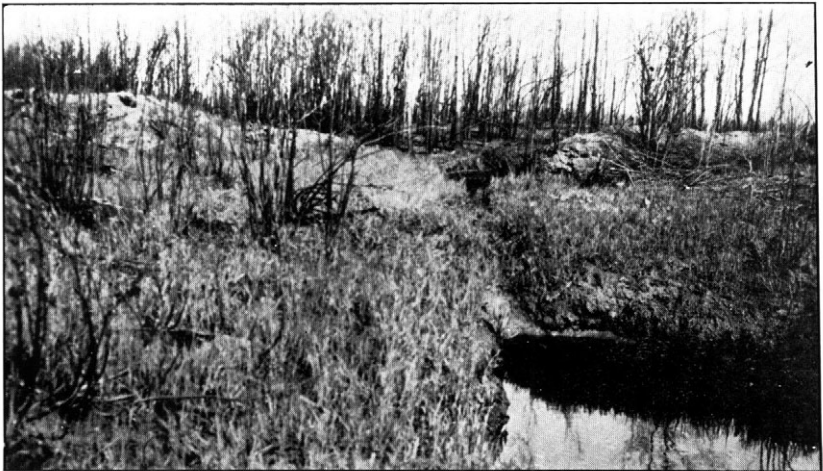
Fig. 2—Ancient beaver dams are numerous on the level topography of both the wooded and parkland soils. Some of the dams are a half mile in length.