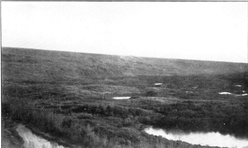
Fig. 3—Clear River valley, showing rough lands unsuited to cultivation.