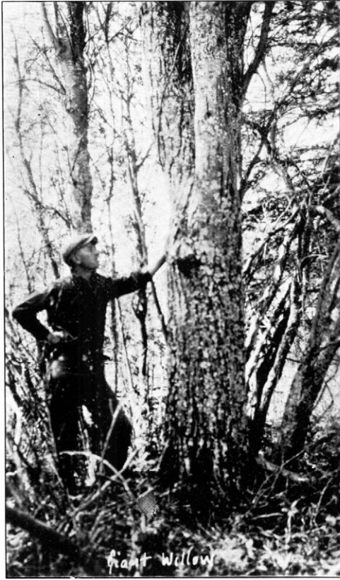
Fig. 1—Giant willows are often found growing on the wet areas of the fertile soils. The one shown in the picture has a diameter of 20 inches.