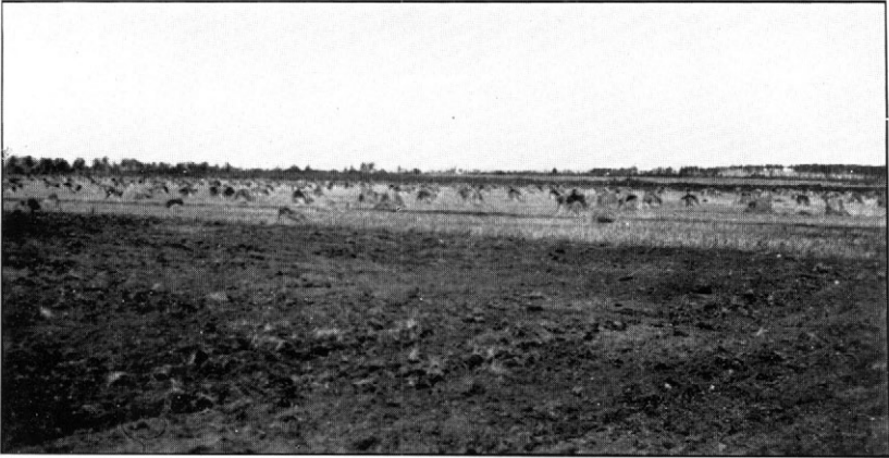
Fig. 2—Parkland soils. Note black soil in foreground and wheat stalks in background. (Yield estimated at 50 bu. per acre.)