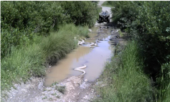
Trail before repair