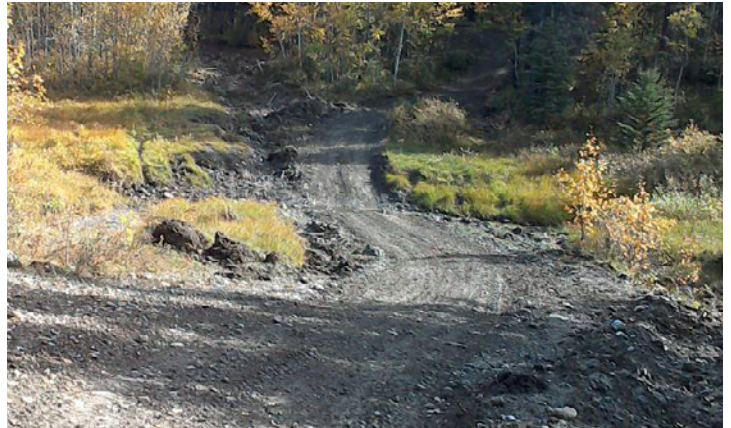
Trail after repairs and user reroutes closed