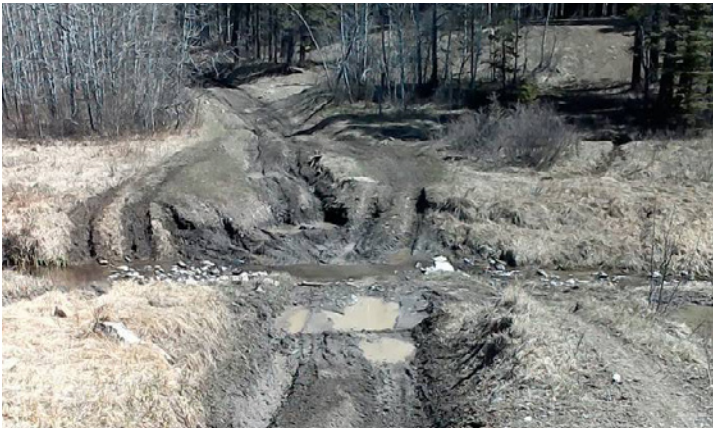
Trail damage and braiding before repair