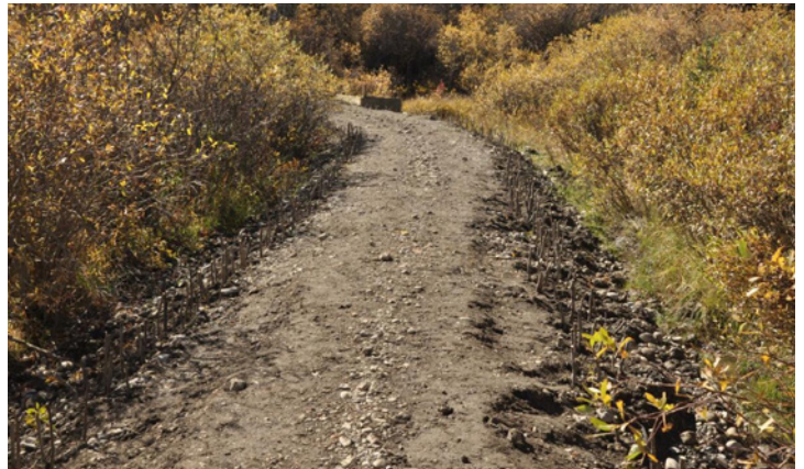
Trail after repair and bioengineering