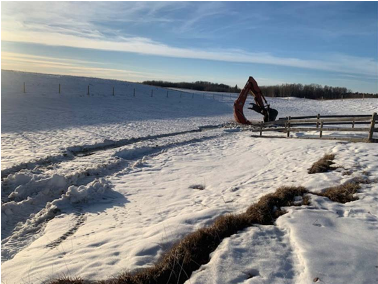
Figure 3. South Elmer's quarter section dugout of the grazing lease on March 18, 2019.

The excavator was located approximately in the middle of the dugout with only the boom exposed above the ice (Figure 3).