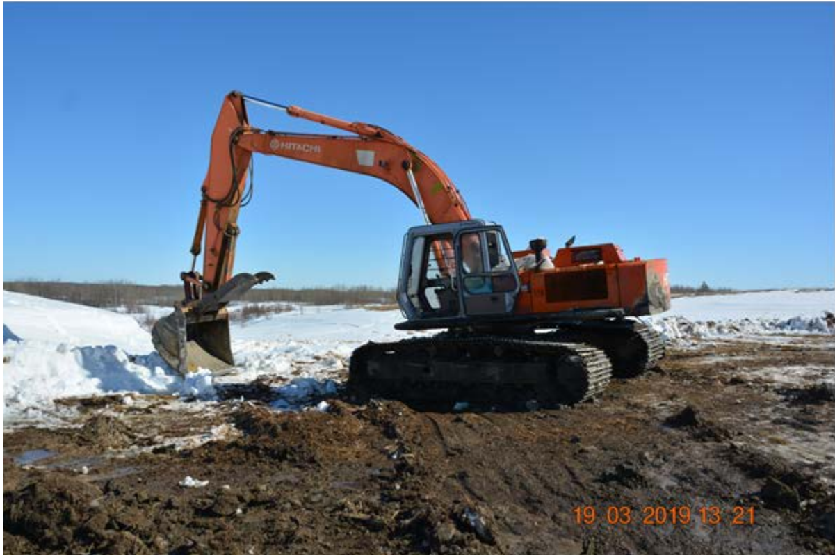
Figure 2. The excavator after extrication from the dugout.

The excavator was owned by the Farm for approximately five to six years prior to the incident. The excavator was primarily used on the Farm property for farm use (Figure 2).