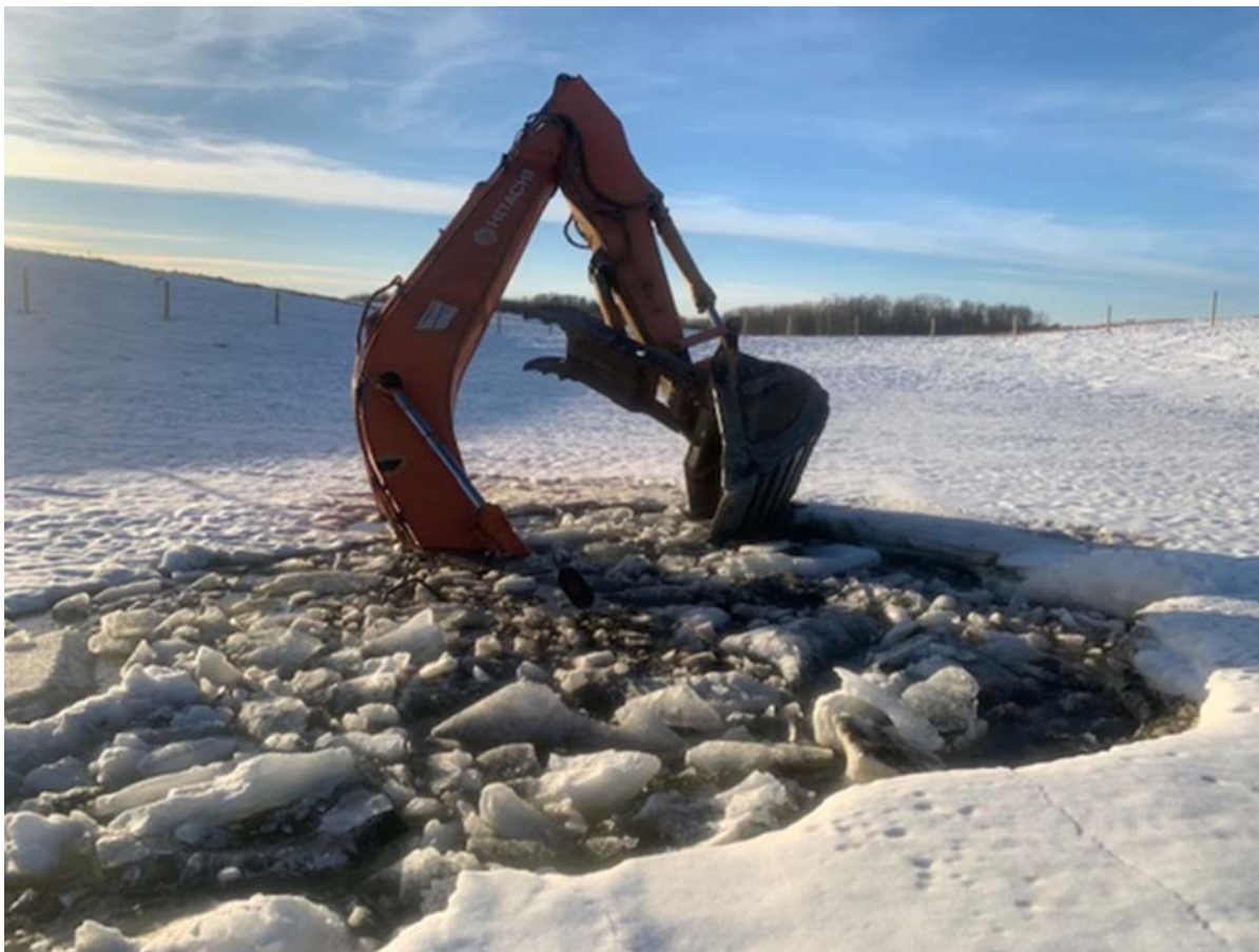
Figure 4. Submerged excavator in the dugout March 18, 2019.

Emergency services were dispatched to assist and worked to remove the submerged excavator (Figure 4).