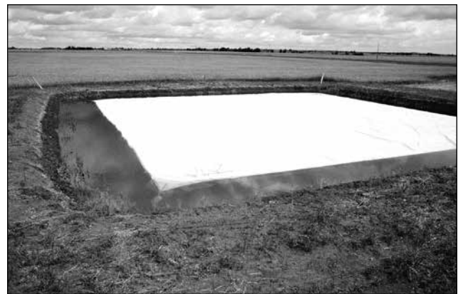
Figure 5. Plastic cover to reduce dugout evaporation losses