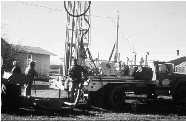
Figure 7. Test drilling to locate groundwater aquifers