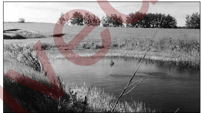
Figure 1. Water is essential

Water is essential to all human activity (Figure 1). The way water resources are managed will determine the future of the prairie economy. Security of water supply has been a primary goal of Canada/Alberta cost-share programs since the drought in 2000. The latest programs are called Growing Forward 1 and 2 (GF1 and GF2), and