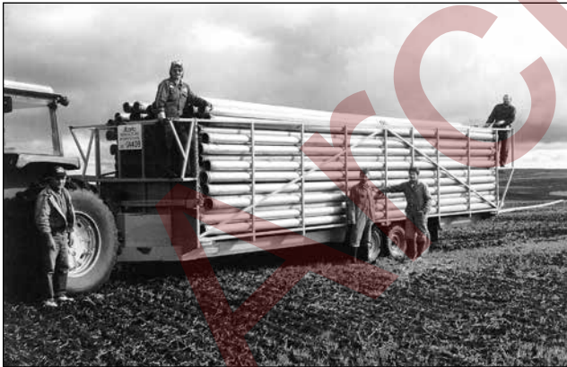
Figure 3. Water pumping program