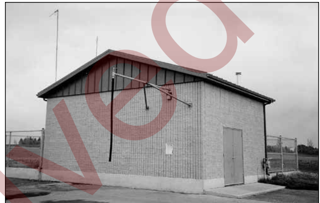
Figure 6. Tank loading facilities

Many farmers have tried unsuccessfully to solve all water supply problems on their own farms. Group projects may be a better alternative.