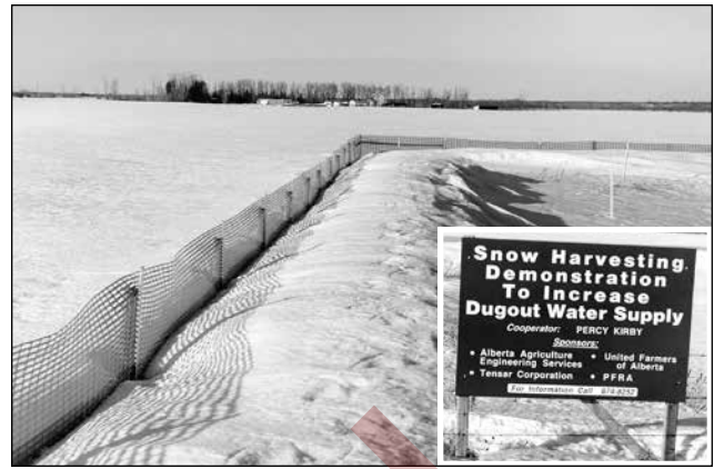
Figure 4. Plastic snow fence placed around the perimeter of a dugout