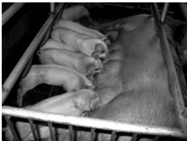
Figure 4. Sow diets can include DDGS, but sows should adapt to the taste of DDGS.

Common inclusions of DDGS in sow diets range from 10 to 20 per cent (Figure 4). Gestation diets for gilts and sows can include as much as 30 per cent wheat DDGS or 40 per cent corn DDGS. Limit wheat DDGS to 20 per cent and corn DDGS to 30 per cent in lactation diets, and introduce DDGS progressively.