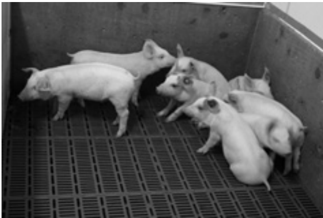
Figure 2. Weaned pigs need to progressively adapt to feeding DDGS.

A step-up inclusion strategy by feeding phase is recommended for weaned pigs to allow them to progressively adapt to the flavour and fibre content of diets containing DDGS (Figure 2). The inclusion of DDGS should not exceed 5 per cent for the first week post-weaning. Dietary inclusion levels can progressively increase thereafter (e.g. 10 % the second week and 20 % the third week post-weaning). To maintain performance, restrict the dietary inclusion of wheat to 15 per cent or corn DDGS to 30 per cent in nursery diets for pigs up to 20 kg.