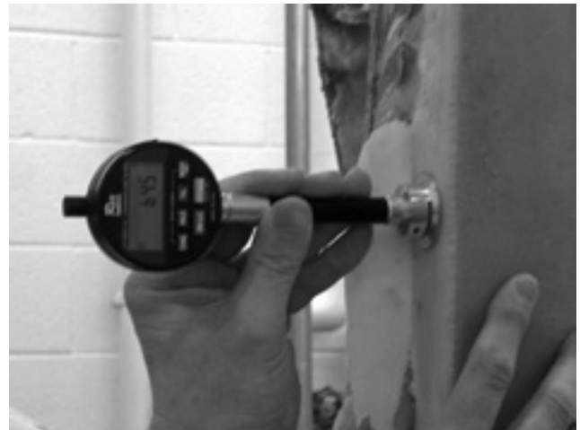
Figure 3. Pork fat softness can be a marketing issue preventable by withdrawing DDGS from the finishing diet.

Asian consumers prefer harder fat because fresh pork is often thin-sliced and boiled or grilled for traditional dishes. Therefore, for hogs fed high DDGS levels (30 to 40 %), the removal of DDGS from the diet (withdrawal) for 3 to 4 weeks before slaughter is necessary to restore pork fat hardness (Figure 3). Producers should implement a 2-week withdrawal period if feeding DDGS at 15 to 20 per cent of the diet. No dietary removal is necessary if feeding DDGS at 5 to 15 per cent of the diet through to market weight.