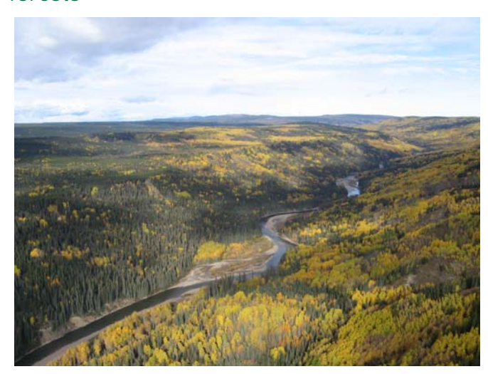
Figure 1. Sustainable management of Alberta forests

Forest Management Plans document how the forests are proposed to be managed over a 200 year planning horizon. This includes details of where, when and how trees will be regenerated following harvesting, as well as forested areas excluded from harvesting. The plans also evaluate forest biodiversity information, and the history and risk of natural disturbance (e.g., wildfire, and insect or disease outbreaks).