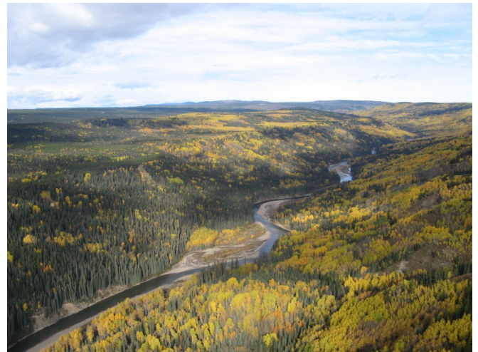
Figure 1. Sustainable management of Alberta forests

Forest Management Plans document how the forests are proposed to be managed over a 200 year planning horizon. This includes details of where, when and how trees will be regenerated following harvesting, as well as forested areas excluded from harvesting. The plans also evaluate forest biodiversity information, and the history and risk of natural disturbance (e.g., wildfire, and insect or disease outbreaks).