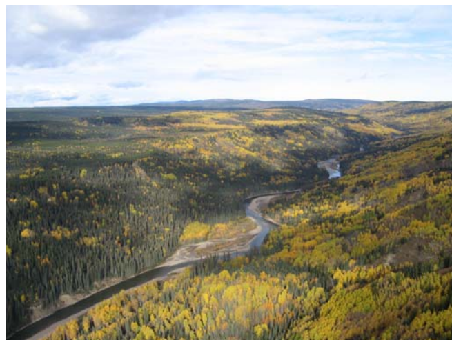
Figure 1. Sustainable management of Alberta forests.

Forest Management Plans document how the forests are proposed to be managed over a 200 year planning horizon. This includes details of where, when and how trees will be regenerated following harvesting, as well as forested areas excluded from harvesting. The plans also evaluate forest biodiversity information, and the history and risk of natural disturbance (e.g. wildfire, and insect or disease outbreaks).