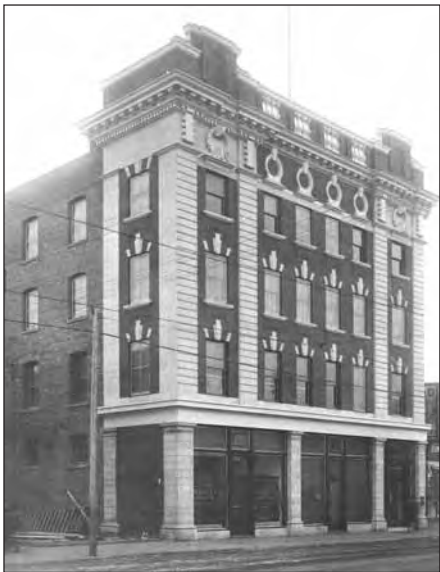
The Moser and Ryder Building (in 1910) before its facelift.