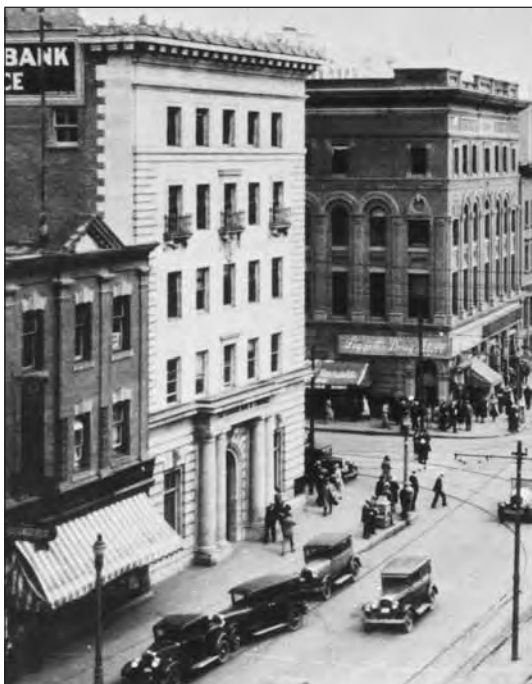
The Canadian Bank of Commerce, 1930.

Traditionally, banks were built in classical styles of architecture which implied stability, security and permanence. This building was one of Edmonton's last and best examples of this tradition. An Edmonton Bulletin article praised the Commerce Bank as "one of the most up-to-date and complete banking institutions in the dominion" and went on to remark very favourably on its design. J. Horsbarch of Toronto was the architect responsible for designing the $400,000 Edwardian Classical Revival Style bank, and its execution was