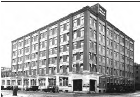
The Revillon Building, 1922.

Established in 1723, the firm of Revillon Frères of Paris, France, traded first in furs and then expanded into wholesale and retail goods as well. Edmonton became their centre of operations in the Canadian west in 1902, and by 1912 they had 96 stores scattered about the country. At the time of its construction in 1912-1913, the Revillon Building was the largest and most sophisticated warehouse in western Canada. Constructed of reinforced concrete, it