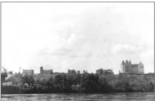
Edmonton's skyline in 1930.

Upon completion of this walk you can continue to Tour II, which begins at the MacLean Block on the NW corner of Jasper Avenue and 107 Street. Or, if you wish to do only this section of the tour, catch an eastbound bus on the south side of Jasper Avenue at 109 Street, or take the LRT (northbound), entrance on the west side of 109 Street, south of 99 Avenue, to return to the centre of downtown.