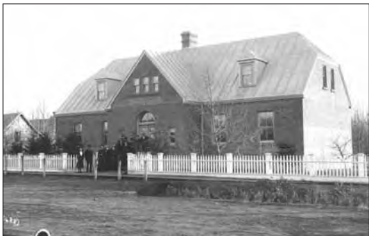
The original appearance of the Land Titles Office, 1902. (PAA B4443)

office away, with the result that the office remained in Edmonton. In 1893, the new “Land Registration and Crown Timber Offices” were built. With walls of brick 18 inches thick and roofed in galvanized iron, it was an attractive and impressive addition to the town. Despite alterations made during the two world wars, when the building served as a meeting hall for various military units, the essential character of the Office, with its jerkinhead roofline and central entrance gable flanked by hipped gables, can still be detected. The Land Titles Office was designated a Provincial Historical Resource in 1977.