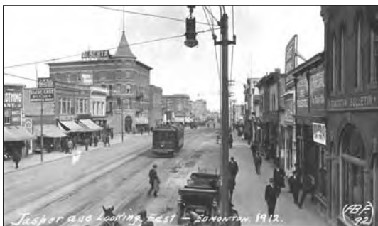
Looking east on Jasper Avenue from 99 Street in 1912. (PAA B4774)

Also of interest in the vicinity is the Edmonton Convention Centre (9797 Jasper Avenue), which has a Visitor Information Centre.