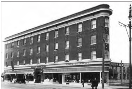
The Gibson Block in 1914.