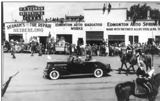
The Edmonton Auto Spring Works, 1939. (CEA EA-160-1163)

The Edmonton Auto Spring Works is first listed in the City Directory in 1924. It is probable that this building was constructed in that