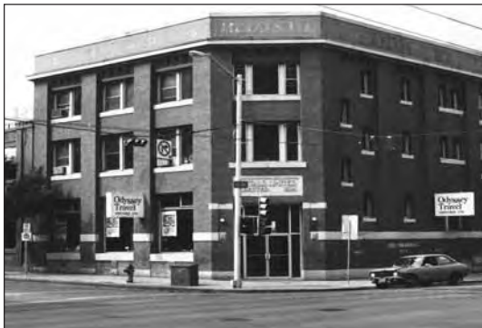
The Metals Building in 1971. (HRMB 71-R15-3)

Development gradually moved west from the eastern edge of the Hudson's Bay Reserve at 101 Street – especially after the land sale of 1912 – and by 1914 the east side of 104 Street from Jasper Avenue to 104 Avenue was heavily developed with substantial brick warehouses. Contemporary maps and photos show the west side as residential and at least partially overgrown