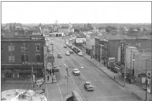
The buildings which occupied the present site of the Convention Centre in 1957.

Little is left today which would indicate that Jasper Avenue East was once as developed on the south side as the north. The image below, as well as the photos on page 3 and page 10 show