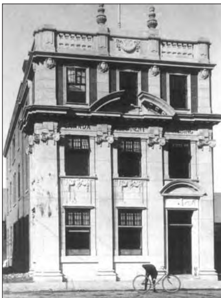
The Canada Permanent Building, 1911. (CEA EA-246-135)

Roland Lines was the architect who designed this sophisticated little building (see II-8, III-7, IV-9). Comparison with the Union Bank building (III-7) reveals the same masterful handling of classical elements. Here, however, Lines has found his inspiration in the Baroque period. The greater vertical emphasis, and the greater concentration on details indicate this change of style. The increased and even exaggerated use of decorative elements such as swags in the parapet date stone, the first floor spandrels, and the urns which look like topiary bushes perched on the balustered parapet, enliven the design and point to a Baroque source. The segmental arch pediments, the larger of which