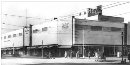
The Bay soon after completion, 1939. (PAA BL261)

F ur trading was the original and exclusive activity of the H.B.C., but as settlers arrived, this was expanded to include providing supplies for the newcomers. Over the years, the variety and volume of goods increased, and the premises needed to house them grew proportionately. The first store was opened in 1890, in a small rented wood-frame building at 98 Street and Jasper Avenue. In 1893, “the Bay” moved to a slightly larger structure of the same type, followed in 1905 by a three-storey brick building on the same site at the northeast corner of Jasper and 103rd. Finally, in 1938-1939, this Moderne Style department store was constructed. The Winnipeg architectural firm of Moody and Moore was responsible for the design of The Bay, which was carried out in Tyndall limestone, black granite, stainless steel and glass block. A third storey was added to the original two-storey building in 1948. In 1954, the building was doubled in size through an expansion to the north. Its eye-catching design and carved historical panels made the Bay an instant and enduring landmark in Edmonton. In 1991-1992 the building was converted to allow for other businesses to share the premises with The Bay. It was designated by the City of Edmonton as a Municipal Historical Resource in 1989.