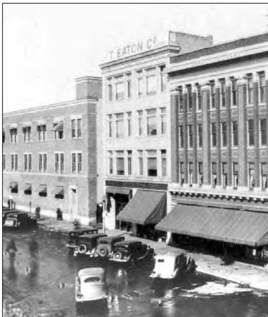
The Ramsey Building (centre) c. 1930. (CEA A86-118)

facade into two bays which are in turn divided into the three-part windows characteristic of the Chicago Commercial Style. The cornice and parapet capping the Ramsey Building are smaller than is generally found in that style, however, making this a unique and interesting design.