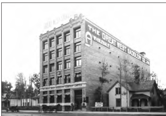
The Great West Saddlery Building, c. 1912.

B oth the Great West Saddlery Building and the original portion of the Horne and Pitfield Building (II-7) were designed by the Edmonton