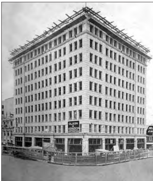
The McLeod Block, one of Edmonton's first skyscrapers, c. 1915.

The McLeod Block became an instant Edmonton landmark when it was completed in 1915. The crowning glory of Kenneth McLeod's career as a businessman and developer, this was the city's tallest building at