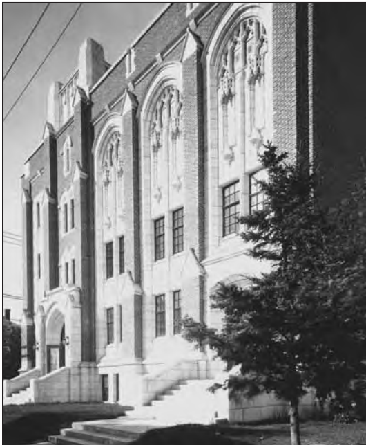
The Gothic Revival Style Masonic Temple, 1931. (PAA BL93)

I n the 40 years which followed the formation of Edmonton's first lodge in 1893, another 12 or so had been constituted, but no