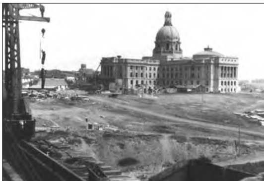
The Legislature Building and the High Level Bridge (left) nearing completion, 1913. (CEA EA-24-11)

Guided tours of the interior of the Legislature Building are available. Times are posted near the entrance.