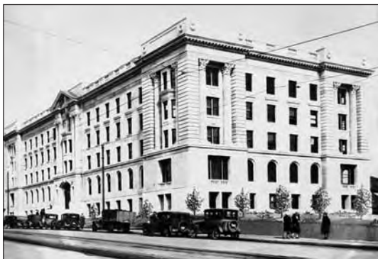
The Bowker Building in 1931.