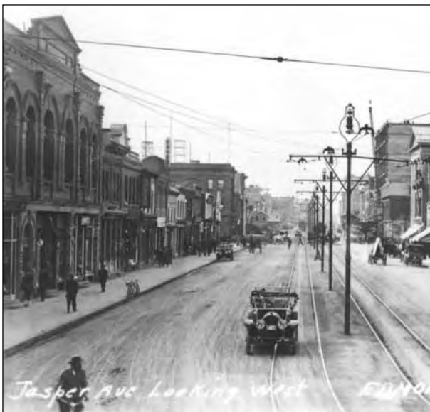
Jasper Avenue looking west from 99 Street in ca. 1910s.

at Fort Edmonton. However, when the two companies amalgamated in 1821, the Hudson's Bay Company post was retained, as was the name Fort Edmonton, and the North West Company connection with Montreal was severed.