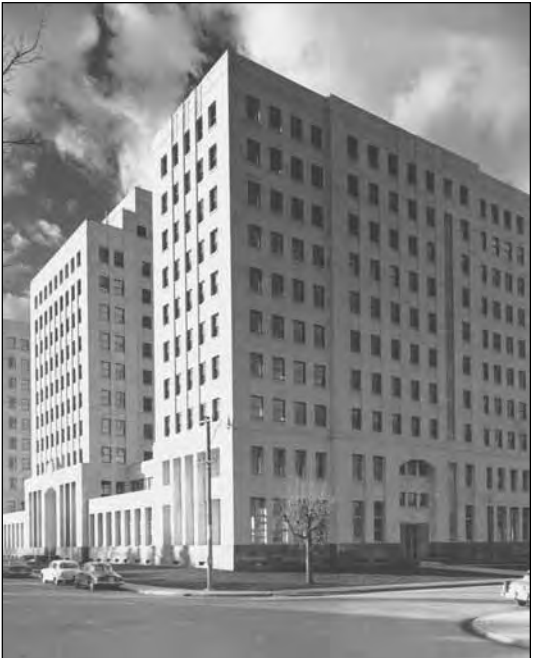
The Federal Public Building in 1957.

Exterior ornament is restricted to the uppermost part of the facade, and to the area surrounding the main entrance. While the chevron is a motif characteristic of the Art Deco Style, the manner in which it is employed in this building is rather more restrained than usual. The metal ornament surrounding the main entry and the interior decoration of the entrance foyer, however, more nearly conform with the exuberant use of colour, rich surfaces and precious materials generally associated with Art Deco designs.