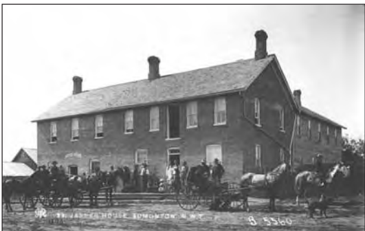
The Jasper House Hotel in 1890.

In continuous operation on this site since 1882, the Jasper House Hotel, now known as the Hub Hotel, was Edmonton's second hotel and has the distinction of being the oldest such establishment remaining in the city. It began as a two-storey, gable-roofed wood frame building with a brick veneer – the only brick building between Winnipeg and Vancouver, and until 1891 the only one in Edmonton. By 1884, the hotel had expanded to almost twice its original width to accommodate the expanding patronage it was receiving. A third storey extended the building up to its present height in 1907, and a rear wing in brick replaced an earlier wood-frame structure in 1912. These latter changes were made by James Goodridge, who bought the property in 1893, though he may have managed it from an earlier date (see IV-1 and IV-3). Goodridge was prominent in the life of early Edmonton, serving on the first town