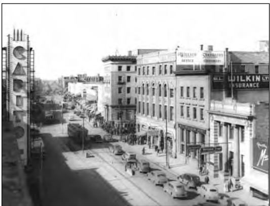
View east on Jasper Avenue from 100A Street, 1947. (PAA BL1387/3)

Recovery came in the 1940s when, during WWII, Edmonton became the base of operations for the construction of the Alaska Highway. Prosperity was ensured with the discovery of oil at Leduc in 1947, and Edmonton entered a new cycle of economic and physical growth. The city boundaries were enlarged, and new construction was initiated in the downtown area. Many historic buildings were replaced by modern structures as the pace of development accelerated. Gradually the downtown core was transformed. Some old buildings remained, however, and were renovated for new uses. These give a glimpse of Edmonton's beginnings and provide a vital link with the past.