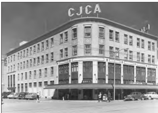
The Birks Building in 1951.

The Birks Building was designed by Nobbs and Hyde, an architectural firm of national significance. Percy Nobbs, who collaborated with Cecil Burgess (see I-11) on the Birks Building, also designed the original master plan for the University of Alberta. Details such as the cornice indicate a link with past styles, but the streamlined appearance and curved corner places the Birks Building firmly on the road to the Moderne Style of architecture (see also III-2, The Bay). “A distinct compliment to the structural and architectural dignity of this city” according to The Edmonton Journal , the Birks Building attracted 5,000 people to its grand opening in 1929. Costing about $350,000 to build, it was a marvel of rich materials and modern technology. Two storeys were originally planned, but when it became apparent that there was a demand for offices with such features as a built-in compressed air system (meant specifically for medical practices), another two were added on top. Only one other Birks Building of this type exists in Canada – in Montreal.