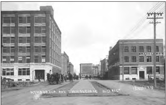
The McKenney Building (right) one year after completion, 1913.