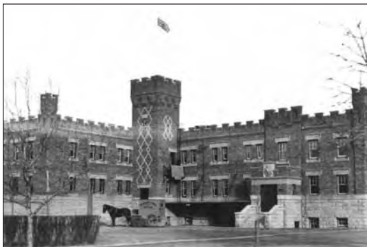
Edmonton's R.N.W.M.P. Headquarters in c. 1932.

I n 1874, Fort Saskatchewan became the first base of the North-West Mounted Police in the area – a choice encouraged, if not wholly determined by a clash of personalities between the Chief Factor at Fort Edmonton, and the