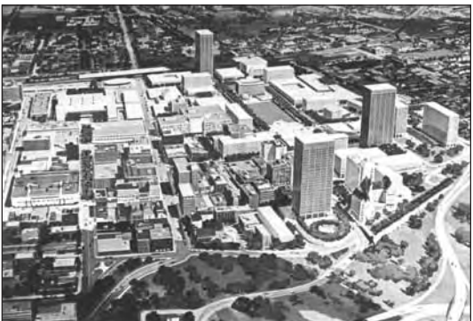
Civic centre concept, 1962.

Approximately 1 km in length, this tour gives an overview of the development of the city's heart – its central business, banking, shopping, municipal government and cultural district. It includes 11 sites and takes about one hour to complete. The tour begins at the Birks Building, on the NE corner of Jasper Avenue and 104 Street. Upon completion of this walk, you can continue to Tour IV, which begins at the corner of Jasper Avenue and 97 Street.