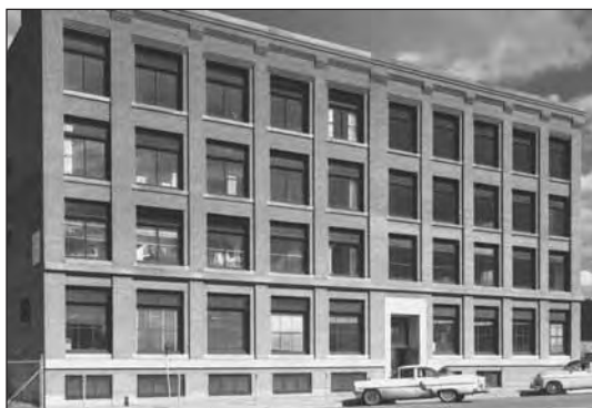
The original Horne and Pitfield Building (right) and its larger annex (left), 1958.