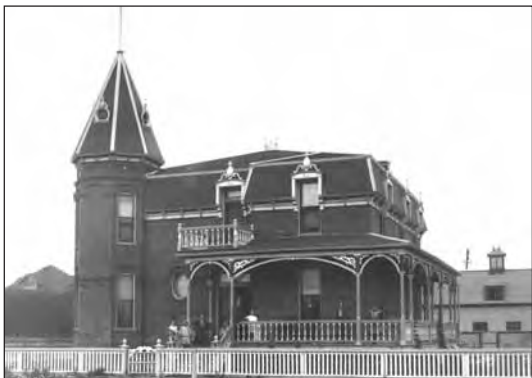
The Gariepy House in 1904.