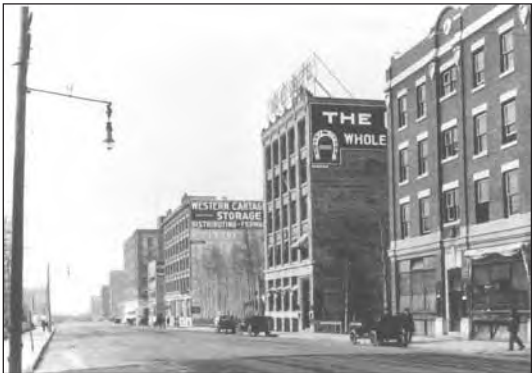
View north on 104 Street from Jasper Avenue, 1914.

This tour begins at the MacLean Block on the NW corner of Jasper Avenue and 107 Street, and contains the largest concentration of historic buildings in the downtown core. It includes 14 sites, is 1.75 km in length and takes about 1.5 hours to complete. Upon completion of this walk, you can continue to Tour III, which begins at the Birks Building on the NE corner of Jasper Avenue and 104 Street.