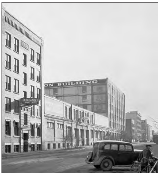
The Canada Consolidated Rubber Building (left), 1933.