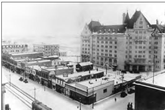
The Macdonald Hotel soon after completion.

The Macdonald Hotel can no longer claim to be one of Edmonton's tallest buildings, but, due to its prominent site on the edge of the river valley and its unique design, the "Mac" remains one of the city's best known landmarks. The Montreal firm of Ross and MacFarlane, which also designed the Fort Garry Hotel in Winnipeg (1911-1913) and the Chateau Laurier in Ottawa (1912), were contracted to design the Macdonald Hotel. Conceived in the best tradition of Canada's famous railway hotels, the Macdonald was built between 1912 and 1915 at a cost of $2.25 million for the Grand Trunk Pacific Railway. Steel and reinforced concrete form the skeleton of the hotel, which is hidden beneath an elegant skin of Bedford Indiana limestone and sheet copper roofing. Elements of French Renaissance architecture can be seen in the hotel; turrets with high-pitched roofs and finials are among its most distinctive features, and the mixture of arcades and corbelled balconies complete the image. Long known as Edmonton's most elegant and popular hotel, the Macdonald was returned to its former glory by