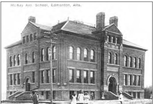
The McKay Avenue School before the 1912 expansion.

Edmonton's first school outside the Fort was erected on this site in 1881. The land was donated by the Hudson's Bay Company and