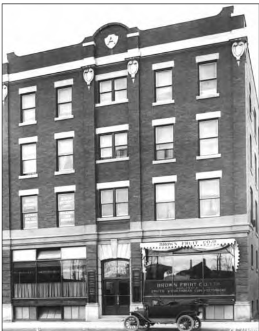
The Armstrong Block, 1927. (GAI NC-6-335)

that another building similar to the blank-walled Saddlery be constructed on the intervening lot. Also interesting are the four stone escutcheons topping the pilaster strips which punctuate the facade, and a fifth in the parapet inscribed with an “A” for the builders of the block. The Armstrong Block was designated as a Municipal Historic Resource in 2001. The building continues to provide retail on the ground floor with apartments above.