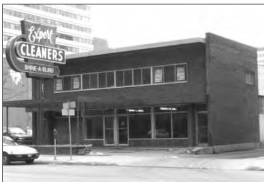
The Expert Cleaners building in 1988.

The Expert Cleaners building is one of a very few examples of International Style architecture from the 1950s remaining in Edmonton. It follows the aesthetic guidelines developed by the functionalist school of design which originated in Europe in the 1920s but reached its peak of popularity 30 years later. Of particular importance to the early development of the style was the idea that a building's form or design should be a direct and rational result of its function, or use. By the fifties however, aesthetics had superseded rationalism, and though the buildings still resembled those actually designed to be functional, it was style rather than use which had become the most important consideration. The Expert Cleaners building demonstrates this later phase of the International Style. Though it is devoid of ornament, it is not designed purely for function. Beautiful marble faces the bottom floor, and a grille, originally suspended over the driveway, served no apparent use – even though it seems to be derived from the covered carriage porches found in former architectural styles.