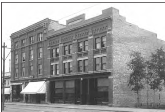
The Jasper Block (right) in 1910.