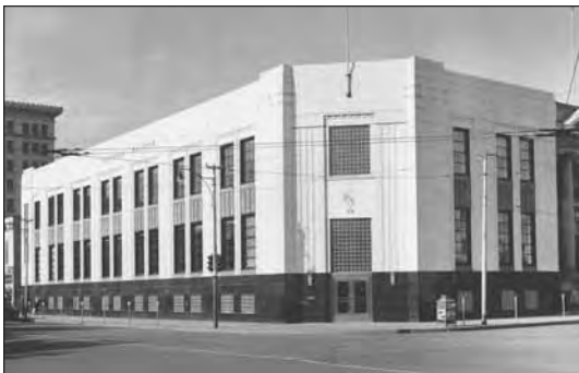
The Churchill Wire Centre in 1949.

The Churchill Wire Centre was designed in 1945 by Max Dewar, the City Architect at the time, as part of a large - unrealised - scheme for the civic square. It is one of the few Moderne Style buildings remaining in the downtown and exhibits many of the typical features of this type of architecture. Of special note are the black granite base, the regular rhythm of windows and pilasters, the stylized cornice and dentils and the chevron motifs in the spandrels. Flattened, fluted pilasters flank the corner entry and the white terrazzo finish on the exterior, the stainless steel detailing and glass block are characteristic of Moderne Style building materials. Above the door is a carving, in low relief, of a figure standing on a globe holding lightning bolts aloft - a popular image of the day intended to represent the idea of long-distance communication using electricity. This building was designated as a Municipal Historic Resource in 1998.