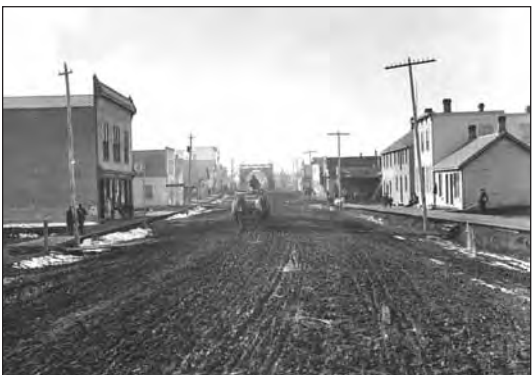
Jasper Avenue looking west from about 96 Street, 1894. Jasper House Hotel third from right.

Anthony Henday, a Hudson's Bay Company explorer, passed near the site of present-day Edmonton in 1754. His trip was part of the Hudson's Bay Company's interest in establishing direct contact with the native population of the interior rather than depending on native middlemen to bring furs to posts located on Hudson's Bay. This change in policy was caused by competition from free traders and other companies such as the Montreal-based North West Company. Throughout the 18th century, the Hudson's Bay Company and the North West Company established a series of posts westward along the North Saskatchewan River valley in search of new supplies of furs. In 1795, as part of the process, the North West Company established a post called Fort Augustus at the site that would eventually become the City of Edmonton. The Hudson's Bay Company immediately followed suit by establishing a post nearby. It was named Edmonton House after an estate near London, England, belonging to the Company's Deputy Governor. Both companies employed many French Canadians and French-speaking Métis, and during the early years, French was the most commonly spoken language