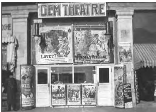
The entrance to the Gem Theatre, no date.

The Gem is one of Edmonton's oldest theatres built especially for the purpose of showing movies. Constructed in about 1908 for the same family which owned the Jasper House Hotel (IV-2) and later built the Goodridge Block (IV-1), the Gem was distinguished by its asymmetrical, classically-inspired street frontage. Elements indicating this classical styling are the pillars which can be seen at each extreme of the facade and the pediment above the door at its western end. The storefronts which originally flanked the main entrance of the theatre are long gone, the awnings, windows and signage removed. Numerous posters above and around the door and a painted signboard flanked by electric streetlights were all that originally indicated the theatre's entrance, but at