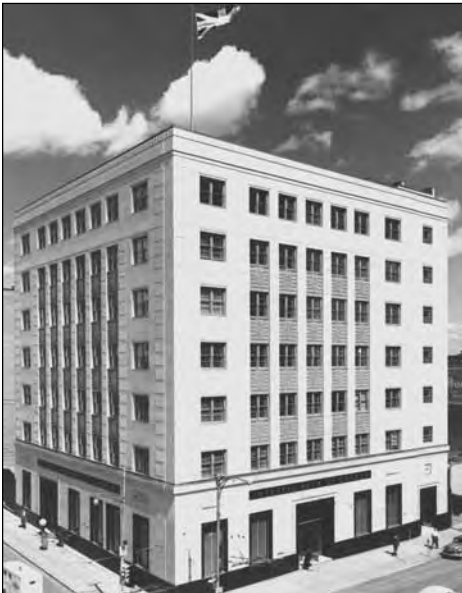
The Imperial Bank of Canada in 1954.

building housed the bank. In about 1906, it was replaced by a much larger and grander structure. Perhaps the most striking feature of the new bank was its Classical Revival Style entrance portico. Supported by giant order columns three storeys tall and elevated on one-storey high plinths, it dwarfed pedestrians and was a very powerful presence on Jasper Avenue. In 1950 this bank, in turn, was demolished to make way for an even larger building, completion of which was delayed until 1952 by a shortage of structural steel. The Edmonton firm of Rule, Wynn and Rule designed this Moderne Style bank, along with company architect, Col. A.J. Everett. Note the relief panels showing trains and planes, the metal spandrels with the bank's logo, and the quoins and pilasters stylized as bands of rectangles. Indiana limestone and black granite provided the Canadian Imperial Bank of Commerce with a slick, geometric silhouette until the year 2000. Today, the building is owned by the Edmonton Chamber of Commerce and houses the World Trade Centre. It was designated as a Municipal Historic Resource in 2004.