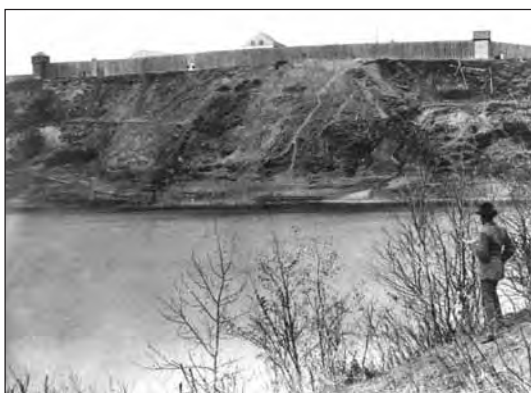
Fort Edmonton, 1871. (CEA EA-128-3)

B ackground historical information appears at the beginning of the booklet, and a general introduction and a route map precede each of the tours. Historical connections between buildings are noted in the text. Wherever possible, buildings are referred to by their original name, or by the name of the original occupant or the most prominent occupant. Oftentimes these do not correspond to their current owners or occupants.