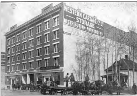
The Phillips Building, c. 1913.

The Phillips Building features generous use of windows and clean, simple lines typical of the Commercial Style of Architecture. Its external walls are made of sand-lime brick burned by the local Alsip Brick and Supply Company.