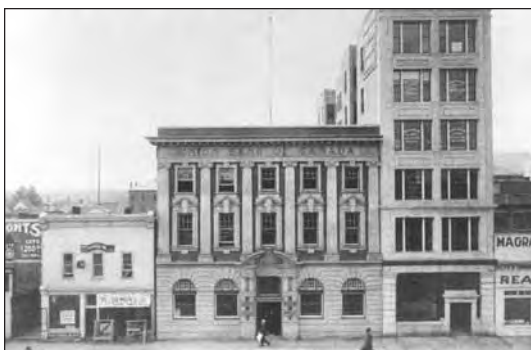
The Union Bank in 1912. (CEA EA-10-222)

The Union Bank building is the only pre-World War I bank remaining in downtown Edmonton. Typically, banks were constructed in a classical style at that period. Ancient Greek or Roman architecture served as a pattern for most, but the inspiration for the design of the Union Bank was the Italian Renaissance. The Edmonton Bulletin described it as “a somewhat new departure in bank buildings in Edmonton.” Telltale features include the rusticated ground floor, the combination of open-bed pediments with oversize keystones above the second floor windows, and the open-topped segmental arch pediment and heavily rusticated pairs of columns which originally framed the entrance. The facade of local pressed brick and Indiana limestone concealed a modern, fire-proof, steel and brick structure. The Union Bank was designed by Edmonton architect Roland Lines (see II-8, III-8, IV-9), and built in 1910 at a cost of $60,000. It is interesting to compare this building with the contemporary Canada Permanent Building (III-8), which was also designed by Lines. The Union Bank Inn was designated as a Municipal Historic Resource in 1996.