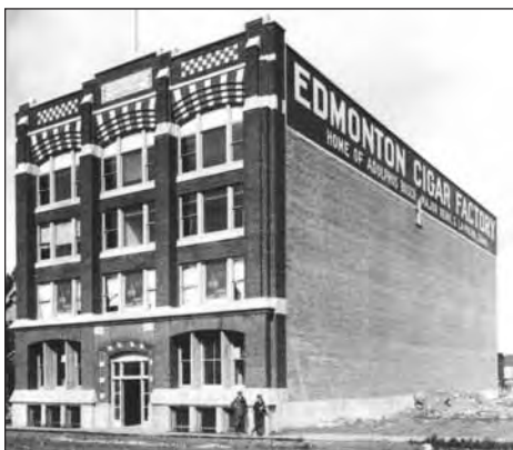
The H.V. Shaw cigar factory and warehouse, 1921.