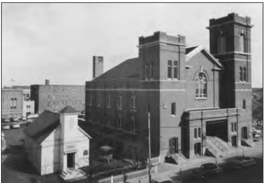
The first (left) and third (right) McDougall Churches, 1920s.

A t the time of its construction in 1909, this fine brick church was known as McDougall Methodist Church in honour of Edmonton's first Methodist minister. After Canada's Methodist, Presbyterian, and Congregational Churches formed the United Church of Canada in 1925, the name was changed to its present form. McDougall United Church was designed by a well-known local architect, H.A. Magoon (see also I-3, II-10, -11, III-3, -5). Architecture that copied historical models was very popular in the Victorian and Edwardian eras. This church is designed in the Italianate Style, a revival of the architecture of Renaissance Italy. McDougall United Church cost $85,000 to build and could seat up to 2,500 people. It was the third church on this site. The original church was built of