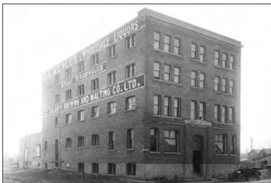
The Mercer Warehouse in 1914.

In 1911, a four-storey block was built on the southeast corner of 104 Avenue and 104 Street opposite the Canadian National Railway yards. It was an uncomplicated building designed for use as a warehouse: it was rectangular in plan and the elevations were unadorned. The loading bays were located at the rear on the east side of the building, conveniently facing towards the railway spur running down the alley. John B. Mercer, in the wholesale business in Edmonton since the 1890s, sold liquors, cigars and wines from a store located on Jasper Avenue before building this functional warehouse to store his stock. Many changes and alterations to the original design of the Mercer Warehouse can be detected. Among the most obvious are the loss of the fourth storey (possibly through fire), the addition of the loading bays which have been punched through the north wall, and the three-storey matching annex built on the south side of the warehouse.