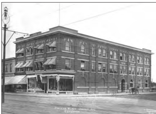
The MacLean Block one year after its construction, 1910.