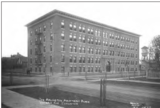
The Arlington soon after completion, 1910.

budgeting, or of the “lightning” speed with which the building was erected. Within the space of a few weeks the steel frame clad in brick was thrown up by as many as 25 bricklayers and 50 carpenters at a time. Nevertheless, the Arlington manages, through pleasing proportions and restrained classical detailing, to create a dignified and imposing presence on the street. The Arlington has been restored and designated as a Municipal Historic Resource in 1998, and as a Provincial Historic Resource in 1999.