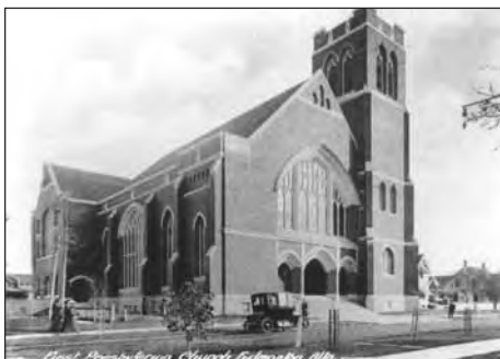
The First Presbyterian Church, c. 1915.