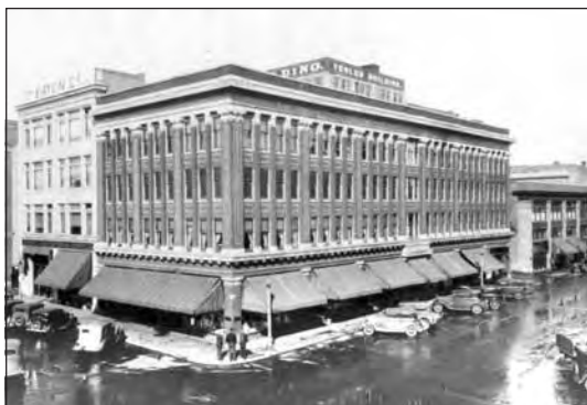
The Kelly Block (centre), c. 1928.