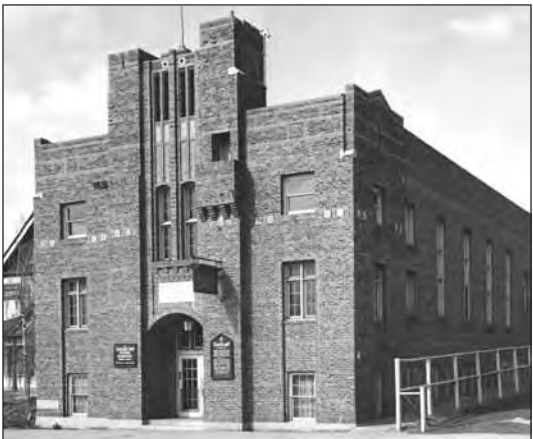
The Salvation Army Citadel, 1943.

T he Salvation Army was founded in England in 1865 in response to the social ills spawned by the industrial revolution. As the name implies, the Salvation Army is organized on a military model, so it is only natural that its meeting hall, the Citadel, be designed along the lines of a fortress. Magoon and MacDonald, architects (see also I-2, II-10, -11, III-3, -5), chose clinker bricks for the facade of the Citadel and incorporated turrets in their 1925 design to give it a rugged, castle-like appearance. Polychrome tiles lighten the mood, and the towers in the centre of the facade echo the