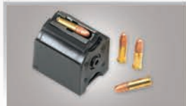
Patented, Detachable 10-Shot Rotary Magazine