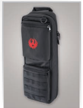
Packed in a Rugged, Ballistic Nylon Case (Included with Rifle)