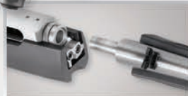
Barrel and Action are Easily Separated and Reassembled for Ease of Transportation and Storage