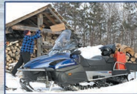
Yamaha VK Professional