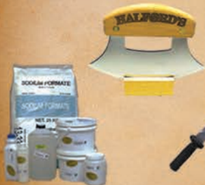
Tanning chemicals and preparation tools