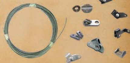
Snares and snare making componets