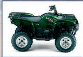
700 Grizzly (Power Steering)