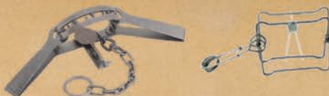
Name brand Traps