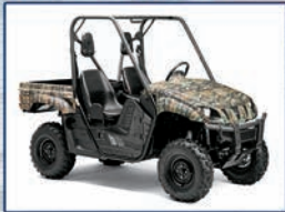
Rhino 700 EFI