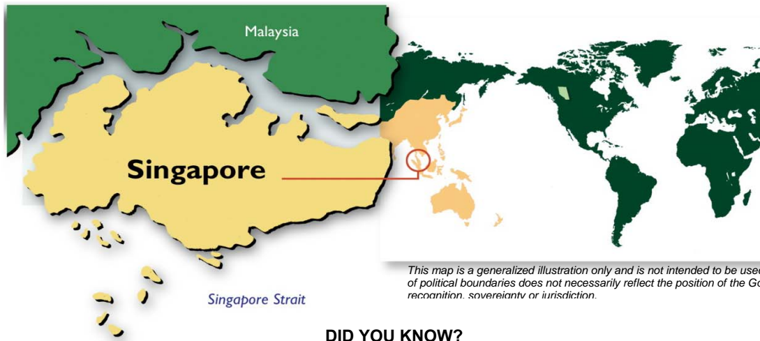
This map is a generalized illustration only and is not intended to be used for reference purposes. The representation of political boundaries does not necessarily reflect the position of the Government of Alberta on international issues of recognition, sovereignty or jurisdiction.