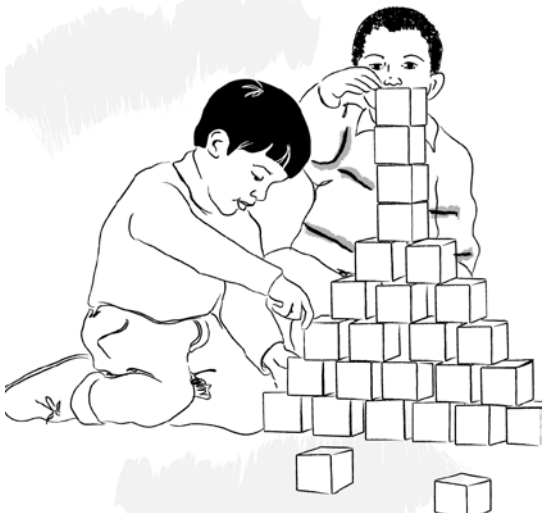
These students are learning to experiment.

Students learn new things in different ways. They use computers, books and equipment. They learn by trying things and talking with others. Sometimes students work in groups. Sometimes the whole class works together.