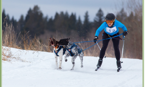
Kat in the Cariboo Bite with Saki (biter) and Sprint (bitee).

get fat! No joke, trees increase carbon storage in the form of starches and fewer sugars as they grow old.