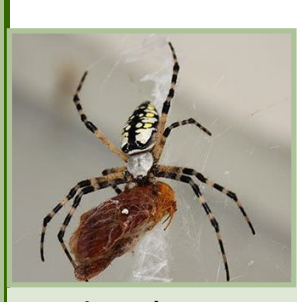
Female Argiope aurantia feeding on a male clear oakworm moth.

However, we are not the only ones to exploit the chemical communication of insects... Argiope aurantia , an orb weaving spider found in the U.S. and southern Canada, is a perfect example of how finding love via chemical communication can go awry. Females of this large and easily recognizable species build their webs in tangled vegetation. They're ambush predators that