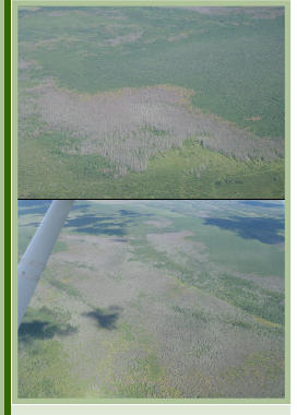
Northern Minnesota, mid-August, 2012. The grey trees are tamaracks killed in previous years, yellow trees killed in spring 2012.

Canadian Maritimes, larch budmoth ( Zeiraphera spp. ) in Alaska, and other varied predisposing factors throughout the north-eastern United States (Werner 1986, Langor and Raske 1989b). These eastern larch beetle outbreaks affected millions of hectares of tamarack forest and resulted in up to 80 – 95% mortality of tamarack within forest stands (Langor and Raske 1989a, 1989b). Equally important, these beetle outbreaks demonstrated the potential for eastern larch beetles to become agents of severe forest disturbance and prompted some of the first detailed studies of eastern larch beetle biology (Werner et al. 1981, Werner 1986, Langor and Raske 1987a, b, 1988b).