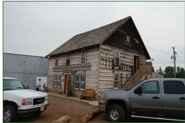
The Trapper Shack in Fort Vermilion

One last, long day of driving. We start the day out at the beautiful pine stands around Machesis Lake, southeast of High Level. Pine beetles have made their way up here and we find some naturally attacked trees with a few beetles that have made it through the winter. Not good. On to the oldest settlement (along with Fort Chipewyan) in Alberta, Fort Vermilion. On the banks of the Peace River, the tiny hamlet of 714 was established in 1788 and has quite a few neat, historical buildings to see but more importantly, a stop in for lunch at The Trapper Shack. This neat little restaurant is built inside an old house that was originally built around 1908 and later converted into a restaurant and boarding rooms in the 1940’s. It is decorated with lots of old memorabilia and local pictures from the 70’s and 80’s. It serves up some delicious food and is a local favourite.