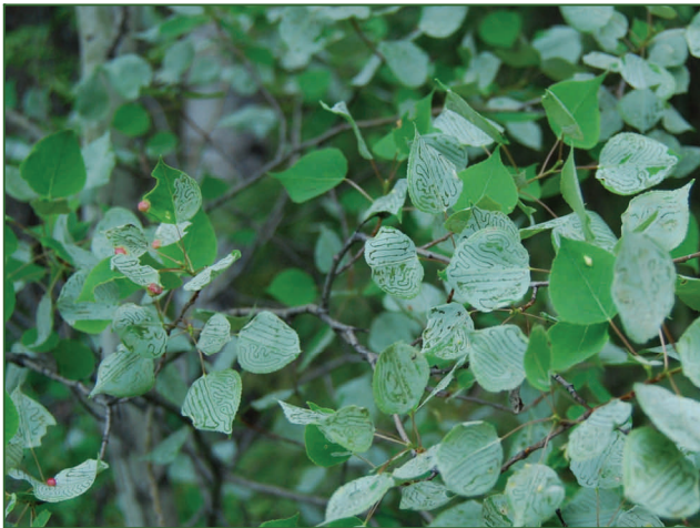
Aspen Serpentine Leafminer damage near Rainbow Lk

A very long day of driving with many kilometres down paved highways, gravel roads, muddy oil field roads and the sometimes dodgy, Adair fire lookout tower road. Our day starts out at the Chinchaga River once again, meeting up this time along highway #58. We are establishing budworm traps and also putting up mountain pine beetle dispersal baits. Pine beetles have been moving north each year into the Upper Hay Area and we are monitoring this progression. Then on to Rainbow Lake, heading south to put up more budworm traps and then north to take a look at some of the fading mountain pine beetle-killed trees. We find that the beetles have survived the winter quite well. The aspen serpentine leaf-miner is also in full outbreak stage in this area as the majority of leaves are infested with larvae. Then back east and north up to the Aboriginal community of Chateh, one of three communities of the Dene Tha First Nation. It was a very interesting place as we drove past the old church, above ground burial grounds (Spirit Houses) and the old cabins and houses. The community's previous name was Assumption but was recently changed to Chateh, the name of an early 20 th century Chief.