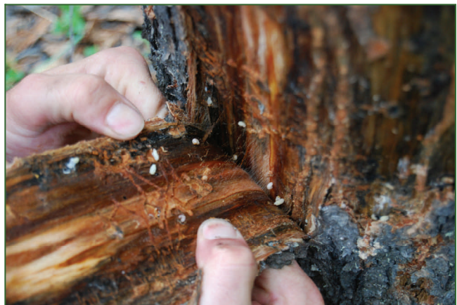
Mountain pine beetle larvae near Rainbow Lake

We finally reach Zama City, a hamlet of 250 people located about a 150km drive from High Level. There is lots of aspen serpentine leafminer here as well. The oil and gas community has been in existence for over 35 years and we have used its local camps during spruce budworm spray programs in the area back in the late 1990's. A quick, expensive fuel stop and we are on our way back towards High Level, passing a lot more aspen serpentine leafminer damage and putting up traps and baits along the way. The end of our day takes us across the Hay River and then up Watt Mountain road, finishing with a really nice view of the surrounding forests and muskeg to the east.