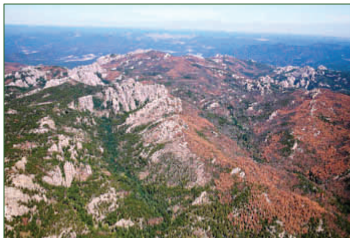
The Black Hills