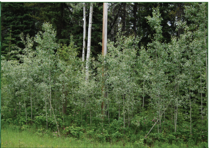
Silvery aspen by Rainbow Lake