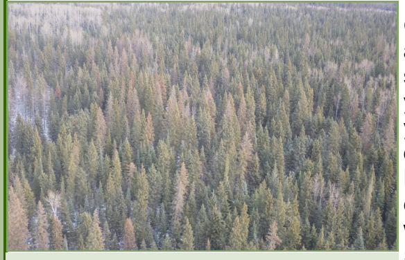
Generally spruce beetles are not abundant enough to attack healthy trees but are found in most stands in small populations. These beetles typically have a two year life cycle. They overwinter as larvae their first year and their second winter as adults. They must overwinter as an adult before they can reproduce. Having to overwinter multiple years increases their exposure to adverse weather conditions and predation which can substantially reduce their numbers. These small populations are usually only able to attack and kill trees weakened by abiotic disturbances such as wind throw, fire, flooding or road and harvesting

This year while doing our annual forest health surveys we mapped 650 ha of mature spruce with spruce beetle, Dendroctonus ruffipennis (Kirby), infestations from 5 to 40 percent. Most of these stands are at the bottom of large drainages mainly in the Nordegg, Wawa, and Baptiste rivers. From the condition of the trees it appears that the beetles have been in these stands attacking large diameter, healthy trees for approximately five years.