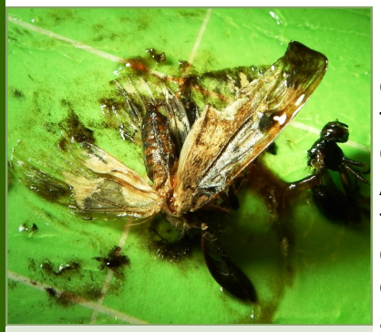
Gypsy moth in sticky trap.