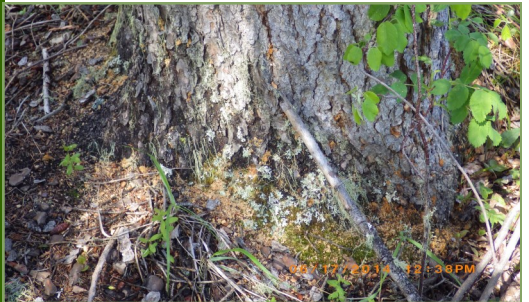
Spruce beetle pitch tubes with boring dust at base of tree.

In the Rocky Mountain House area there were two significant abiotic events in the past six