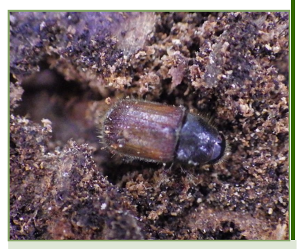
Spruce beetle adult.

Many documented spruce beetle outbreaks in the past were known to have started and built up in large abiotic disturbances and then moved into adjacent mature, healthy stands. An infestation in the Yukon in the 1940's of 50 000 ha was thought to have been started by log decking during the building of a road. More recently another outbreak in the Yukon from early 1990s to 2007 of 380 000 ha is thought to have been initiated by drought and an increase in temperature. Not only were the trees stressed due to dry, warm conditions, the higher temperatures sped up beetle development in mid-1990s and 2004. During these years the beetles developed into adults in their first summer so that they were able to only have a one year life cycle which rapidly increased their population.