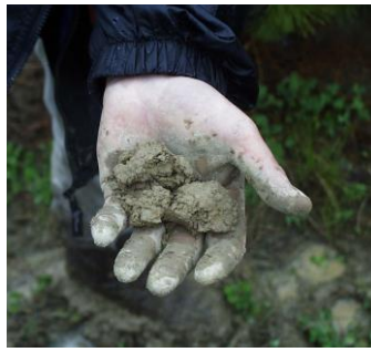
Some risk of compaction