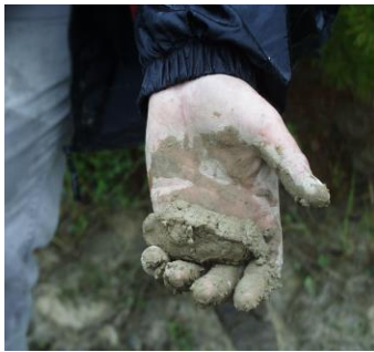
High risk of rutting and/or compaction