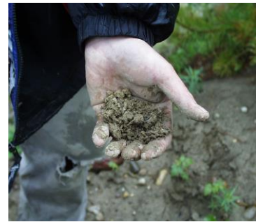
Low risk of compaction